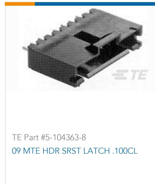
TE Part #5-104363-8 09 MTE HDR SRST LATCH .100CL