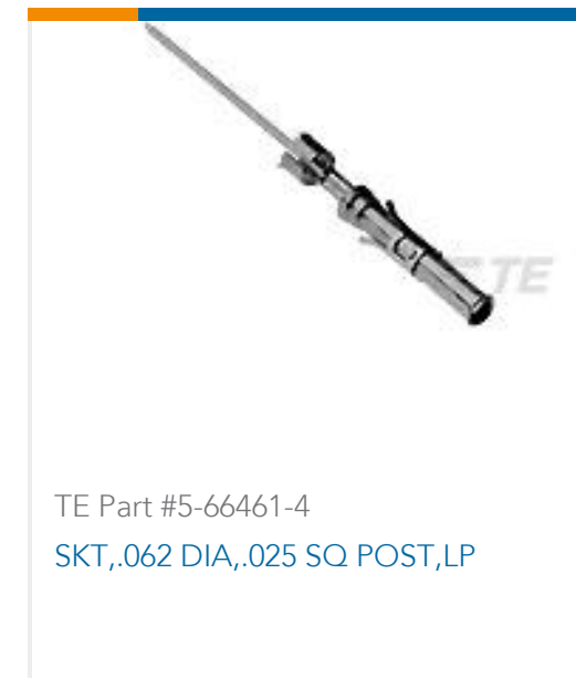
TE Part #5-66461-4 SKT,.062 DIA,.025 SQ POST,LP