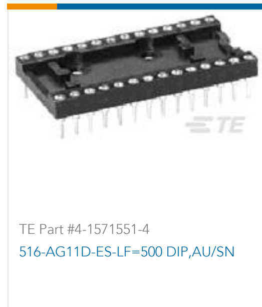
TE Part #4-1571551-4 516-AG11D-ES-LF=500 DIP,AU/SN