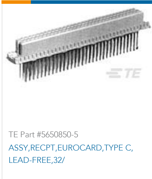
TE Part #5650850-5 ASSY,RECPT,EUROCARD,TYPE C, LEAD-FREE,32/