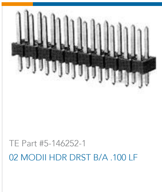
TE Part #5-146252-1 02 MODII HDR DRST B/A .100 LF