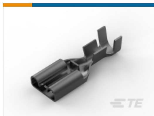
TE Part # 63854-2 250 PL MKIII REC. 18-14AWG TPBR