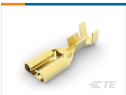
TE Part # 63854-1 250 PL MKIII REC. 18-14AWG BR