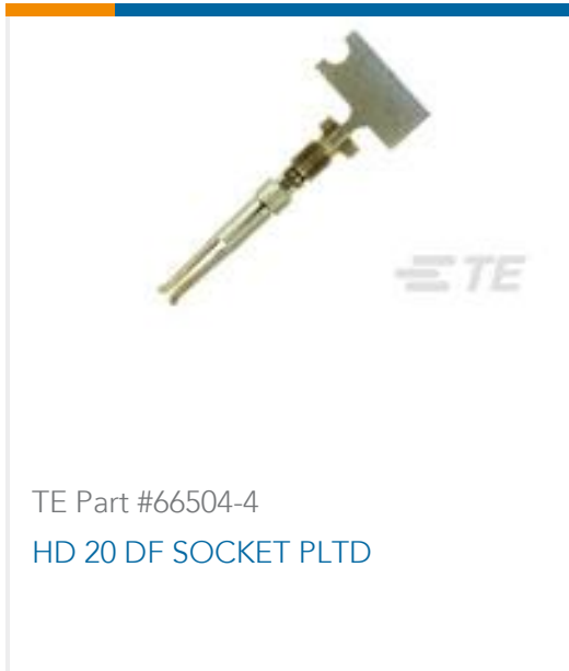
TE Part #66504-4 HD 20 DF SOCKET PLTD