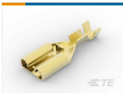
TE Part # 63933-1 PL .250 TERMINAL REC 22-18 AWG BR