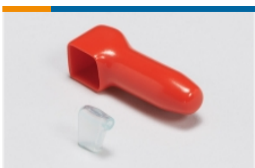
Insulation Boots & Sleeves(4)