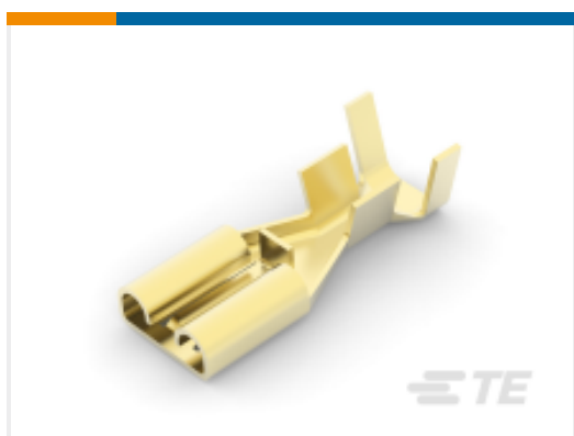
TE Part # 1217092-1 PL 250 TERMINAL RECEPTACLE 16-12 AWG BR