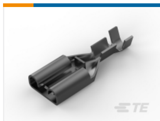
TE Part # 63933-2 250 PL MKIII REC. 22-18AWG TPBR