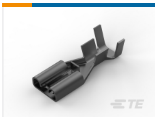
TE Part # 1217092-2 PL 250 TERMINAL REC 16-12 AWG TPBR