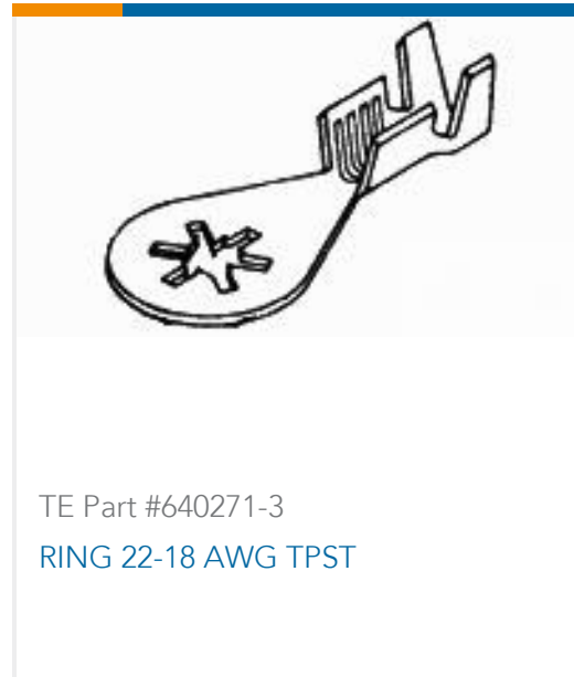
TE Part #640271-3 RING 22-18 AWG TPST