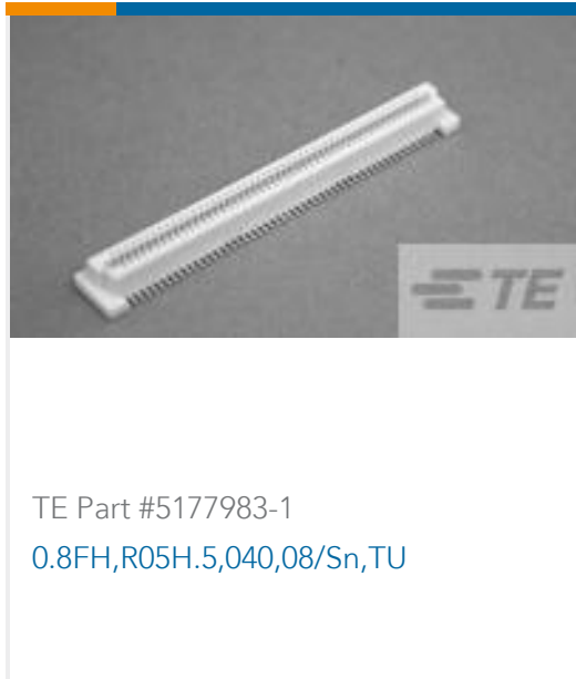
TE Part #5177983-1 0.8FH,R05H.5,040,08/Sn,TU