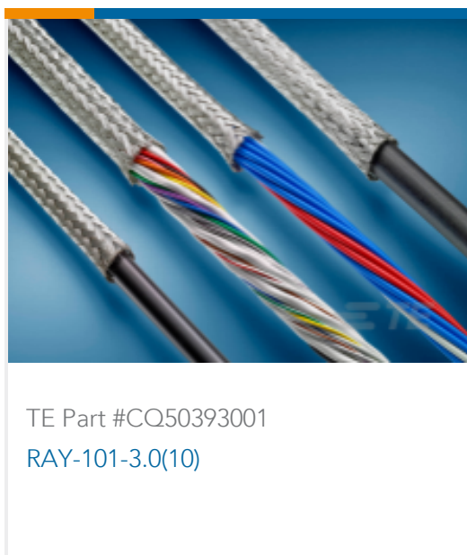
TE Part #CQ50393001 RAY-101-3.0(10)