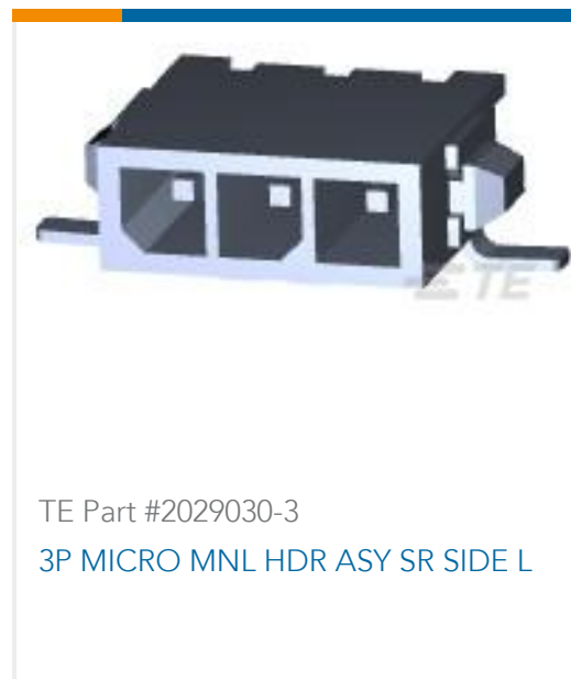
TE Part #2029030-3 3P MICRO MNL HDR ASY SR SIDE L