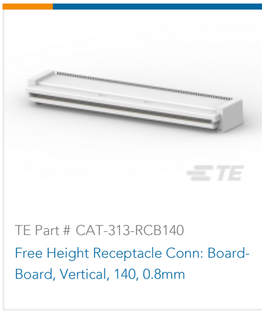
TE Part # CAT-313-RCB140 Free Height Receptacle Conn: Board-Board, Vertical, 140, 0.8mm