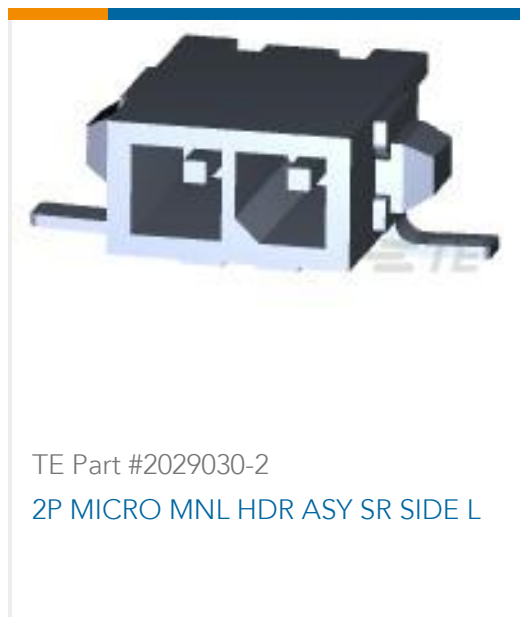
TE Part #2029030-2 2P MICRO MNL HDR ASY SR SIDE L