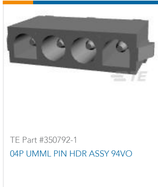
TE Part #350792-1 04P UMML PIN HDR ASSY 94VO