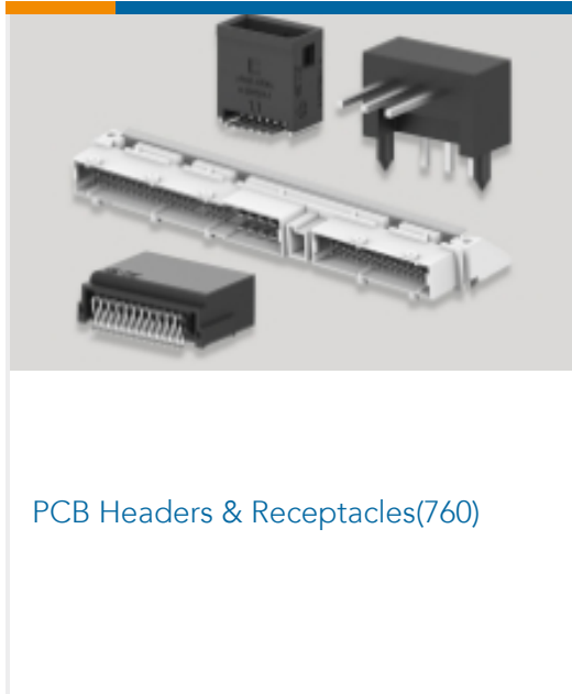
PCB Headers & Receptacles(760)