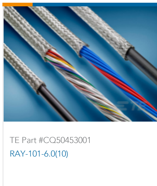
TE Part #CQ50453001 RAY-101-6.0(10)