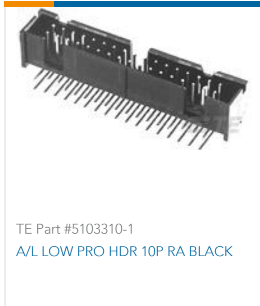
TE Part #5103310-1 A/L LOW PRO HDR 10P RA BLACK