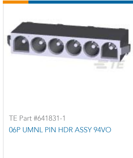
TE Part #641831-1 06P UMNL PIN HDR ASSY 94VO