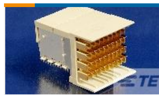
TE Part #6469048-1 HMZD 4PR RA HDR 80P ASSY LF