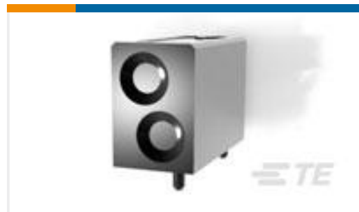
TE Part #1469374-1 ATCA GUIDE RIGHT ANGLE FEMALE