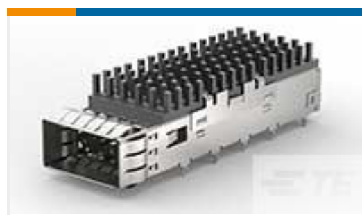
TE Part #2170704-1 CAGE ASSY, QSP28 1X1, SPRING, HS