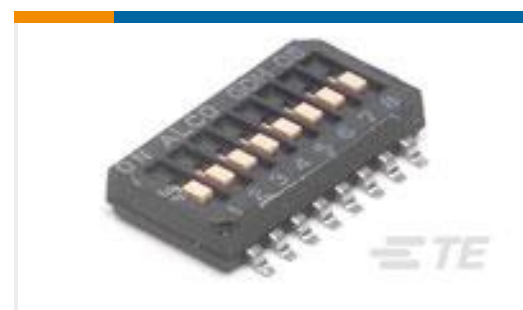
TE Part #1-1571983-1 GDH08STR04=DIP SWITCH