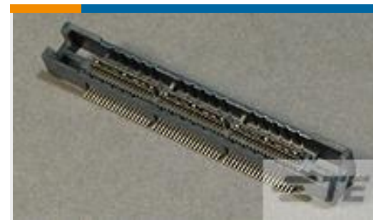
TE Part #1-5767096-0 MICT,REC,114,ASY,.025,TAPE,CAP