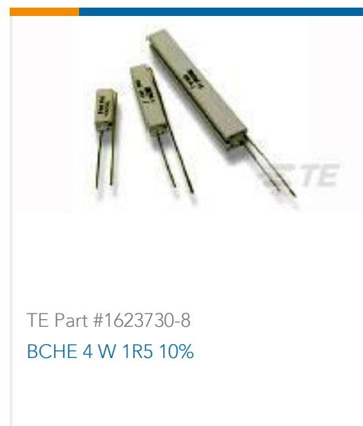
TE Part #1623730-8 BCHE 4 W 1R5 10%