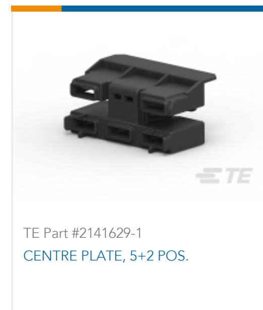
TE Part #2141629-1 CENTRE PLATE, 5+2 POS.