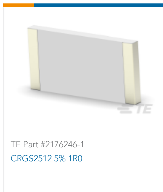
TE Part #2176246-1 CRGS2512 5% 1R0