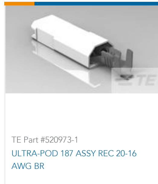
TE Part #520973-1 ULTRA-POD 187 ASSY REC 20-16 AWG BR