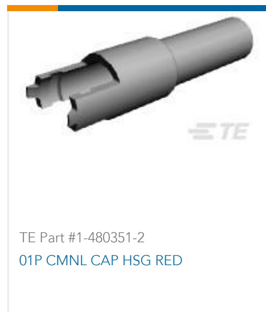
TE Part #1-480351-2 01P CMNL CAP HSG RED