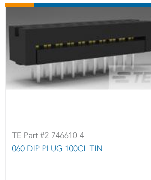
TE Part #2-746610-4 060 DIP PLUG 100CL TIN