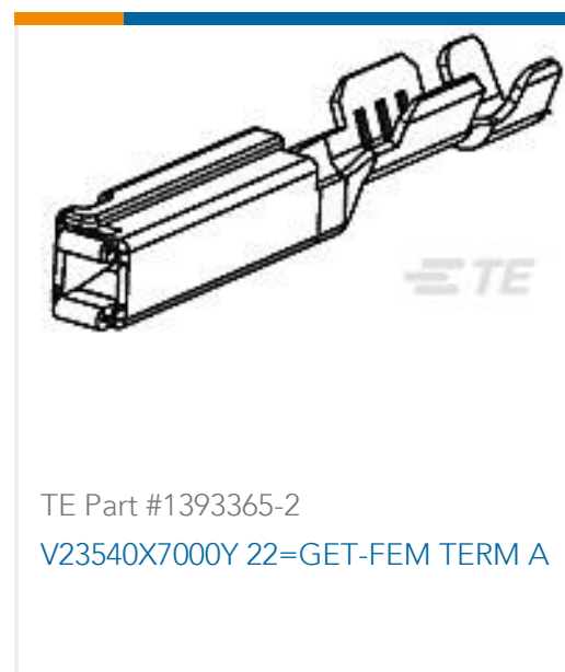
TE Part #1393365-2 V23540X7000Y 22=GET-FEM TERM A