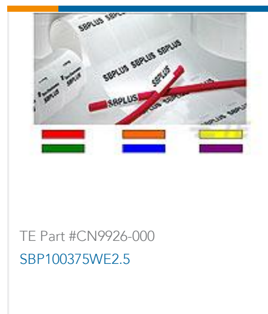
TE Part #CN9926-000 SBP100375WE2.5