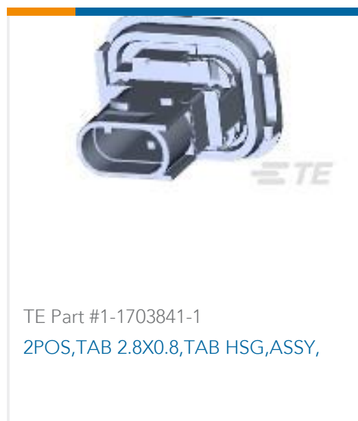
TE Part #1-1703841-1 2POS,TAB 2.8X0.8,TAB HSG,ASSY,