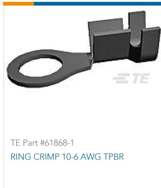
TE Part #61868-1 RING CRIMP 10-6 AWG TPBR