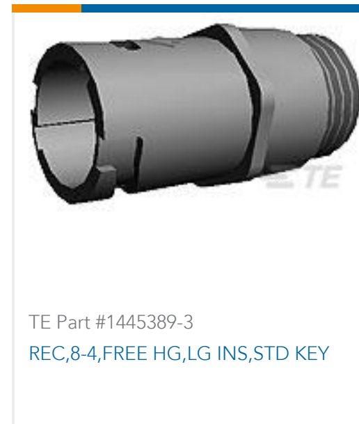
TE Part #1445389-3 REC,8-4,FREE HG,LG INS,STD KEY