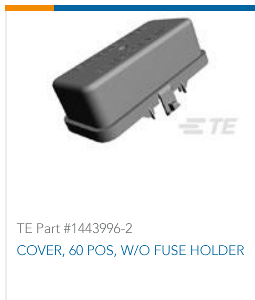
TE Part #1443996-2 COVER, 60 POS, W/O FUSE HOLDER