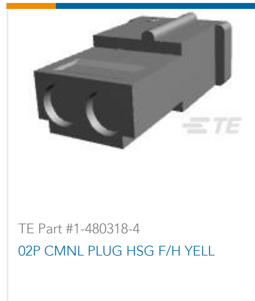
TE Part #1-480318-4 02P CMNL PLUG HSG F/H YELL