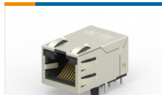
TE Part #2301994-8 RJ45 JACK INT. MAG. 10/100 LED 1X1 INV.