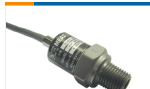
TE Part #M3041-000005-01KPG PRESS XDCR M3041-000005-01KPG