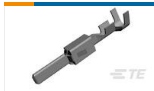
TE Part #1-968947-1 TAB 2.8x0.8 CONTACT CF SWS Sn