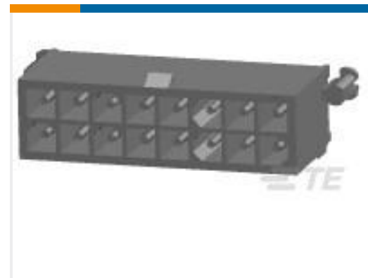
TE Part #1-794075-1 16P MINI UMNL HDR W/O DH AU LF