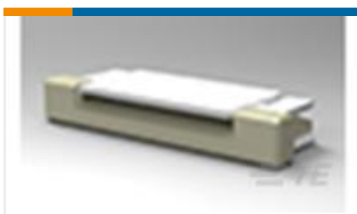
TE Part #4-1734839-0 FPC CONN. 0.5MM PITCH T/C,40P