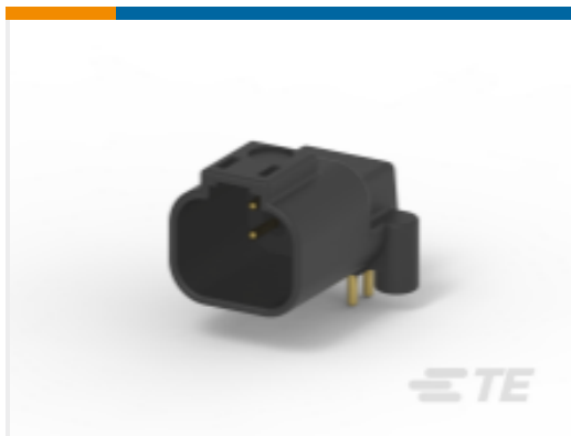
TE Part #DTF13-4P-G003 HDR, 4P, GRY, RA, AU/NI/CU