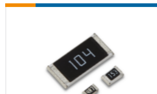
TE Part #1-2176343-0 CRGCO 1206 56R 1%