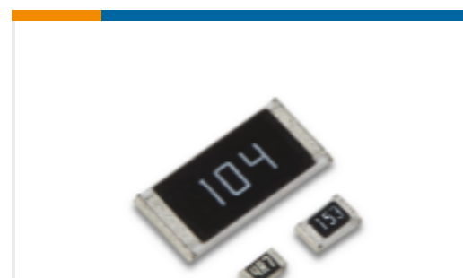
TE Part #4-2176337-9 CRGCO 0402 100K 1%