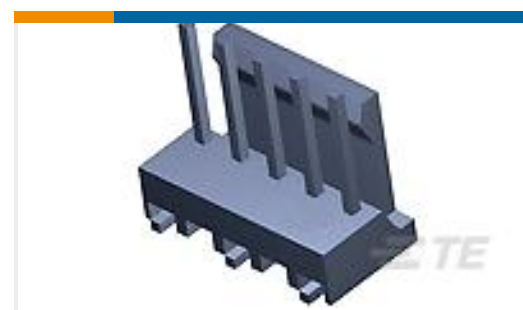
TE Part #3-647502-5 05P MTA100 HDR ASSY,SM,SN, LF