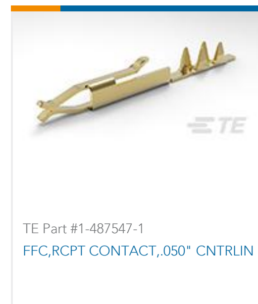
TE Part #1-487547-1 FFC, RCPT CONTACT, .050" CNTRLIN