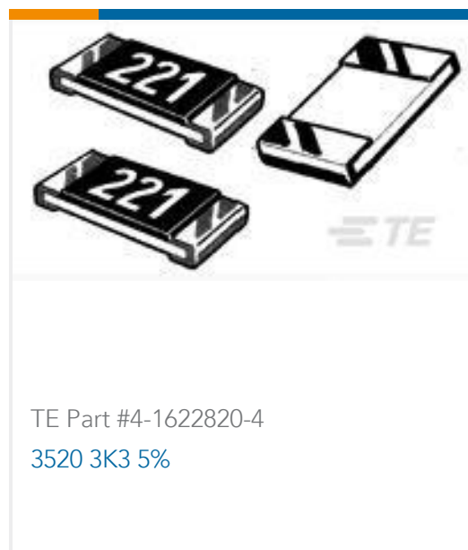
TE Part #4-1622820-4 3520 3K3 5%