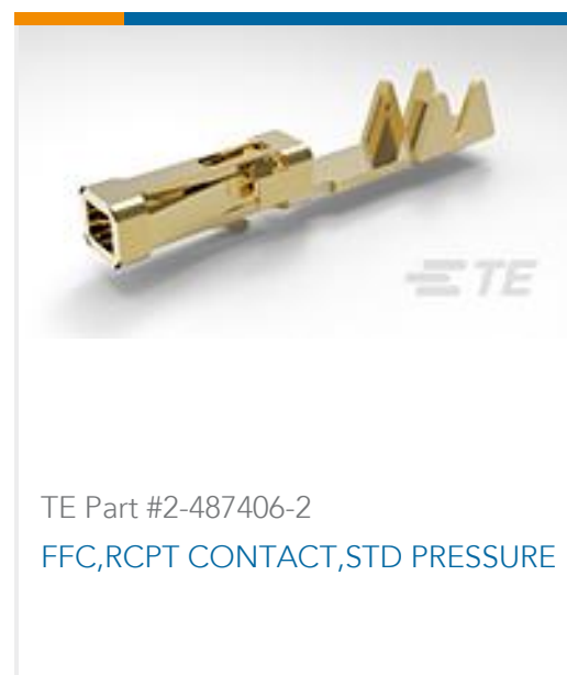
TE Part #2-487406-2 FFC, RCPT CONTACT, STD PRESSURE