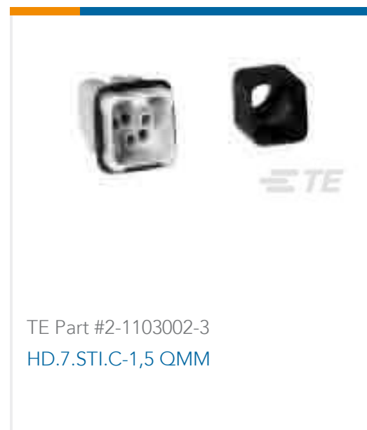
TE Part #2-1103002-3 HD.7.STI.C-1,5 QMM