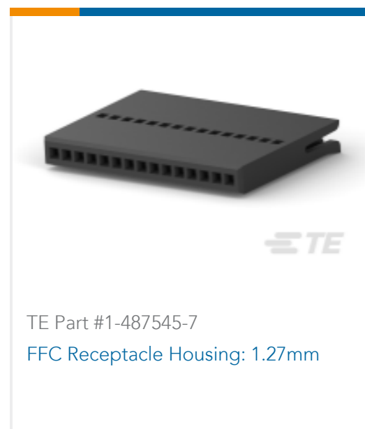
TE Part #1-487545-7 FFC Receptacle Housing: 1.27mm