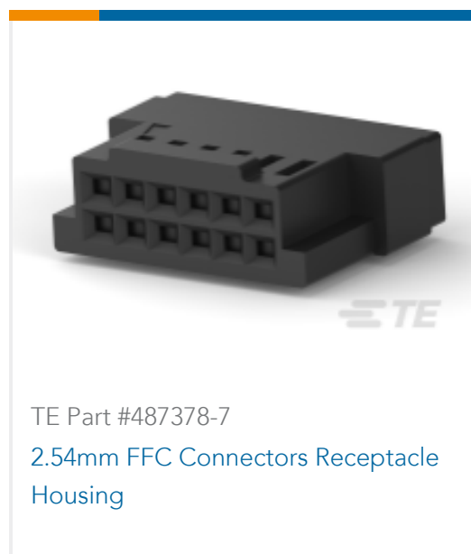
TE Part #487378-7 2.54mm FFC Connectors Receptacle Housing