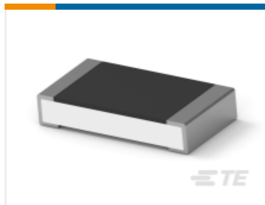
TE Part #3-2176389-1 RQ 1206 221R 0.1% 10PPM 5K RL