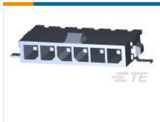
TE Part #2-1445091-6 MICRO MNL HDR ASSY S/ROW AU LF