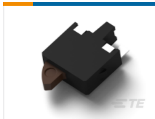
TE Part #2331407-1 DET SW5.5X4.7X2.0 GW HORZ.(R) NO AG RL