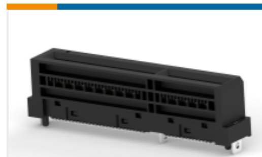
TE Part #2327678-2 RECEPTACLE ASSY, 84 P, VERT, SLIVER 2.0