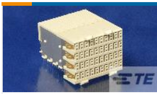
TE Part #1469001-1 HM-ZD 4PR RECP 80P