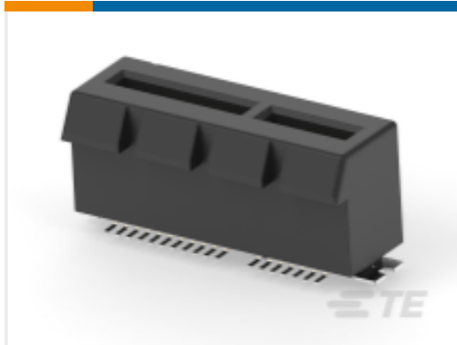
TE Part #2344054-1 PCIe Gen3.0 SMT type connecto,15u" Au