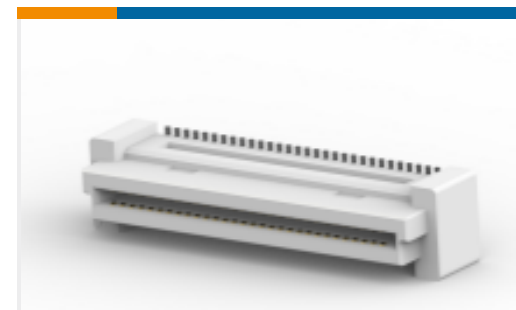
TE Part #5177983-2 Free Height Receptacle Conn: Board- Board, Vertical, 60, 0.8mm