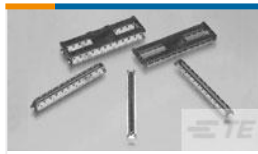
TE Part #3-1827231-6 .5FHR04H,440,B,GIG,08/Sn,HT,NS