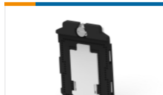
TE Part #2041549-1 SOCKET ASSY, DMD 350, T/R, G/F