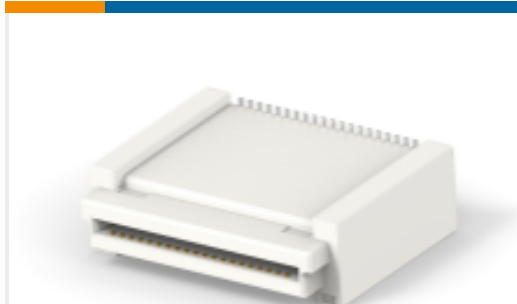
TE Part #2271041-1 0.8FH,R19H.5,040,30/SN,TR,SC