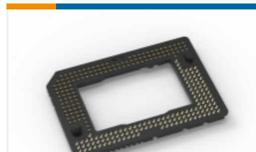
TE Part #2319757-1 DUAL LGA,257 POS, DMD SOCKET