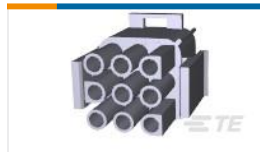
TE Part #1-480706-0 09P UMNL PLUG HSG NATL