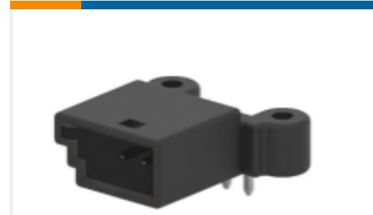
TE Part #2-967573-1 SIGNAL HEADER