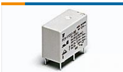
TE Part #1440004-1 PCH-124D2,000