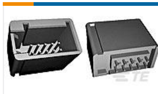
TE Part #969587-2 MOD2 STIFTLAIS2X5P