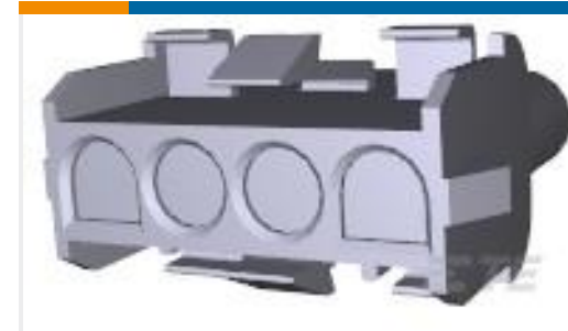
TE Part #1-480703-0 04P UMNL CAP HSG NATL