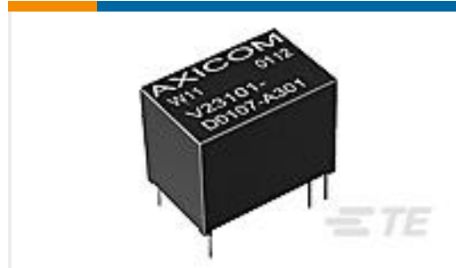
TE Part #3-1393779-3 V23101D 106B201