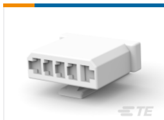
TE Part #880192-2 5 WAY FF 110 HSG REC NYLON 66 NATURAL