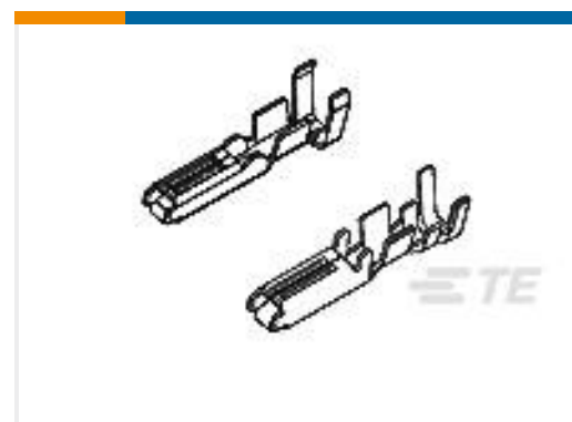
TE Part #284088-1 .070 NEW GEN RCPT CONT 0.75 T