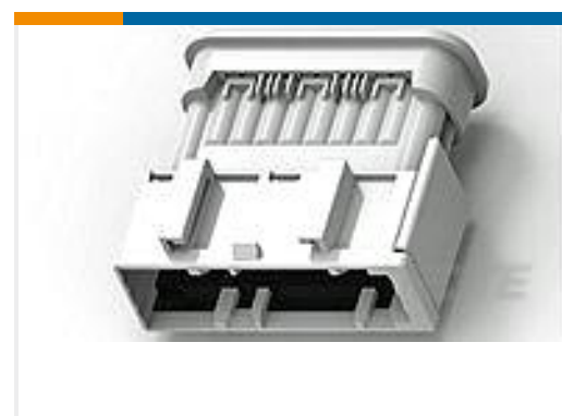
TE Part #282278-1 TAB CONN KIT