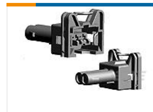
TE Part #444496-1 HSG ASS'Y 2 POSN JR POWER