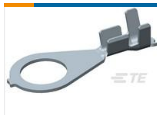
TE Part #880651-2 RING TONGUE 1.0-2.5 MM2 0.60X14. 60 TPBR