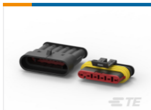
TE Part #282108-1 AMP SUPERSEAL 1.5MM, CONNECTOR HOUSING