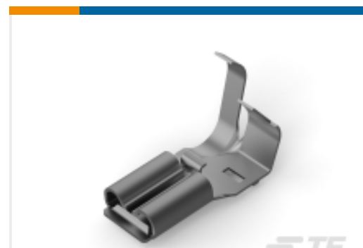
TE Part #1743221-1 250 PL EX FLAG REC. 18-12AWG PTBR