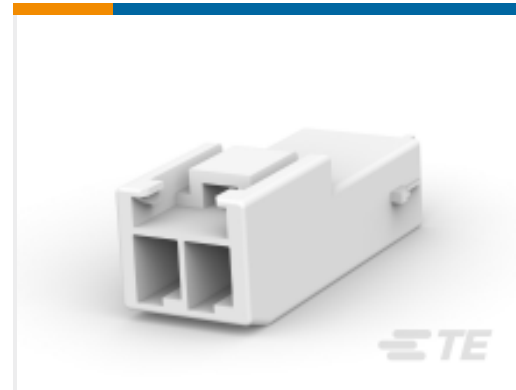
TE Part #5-179463-1 POWER DBL LOCK CAP HSG F/H 2P (GWT)