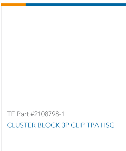
TE Part #2108798-1 CLUSTER BLOCK 3P CLIP TPA HSG