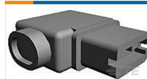
TE Part #1-176497-9 PL EX SLEEVE 250 FLAG BLACK 6/6 NYLON