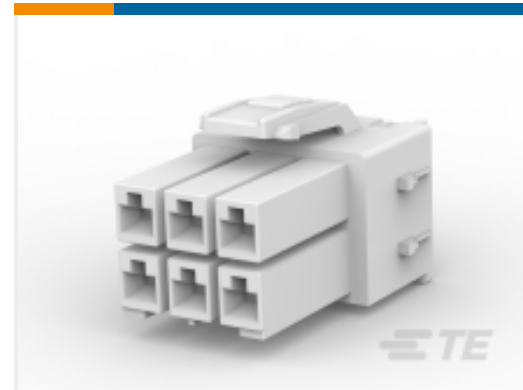
TE Part #5-177899-1 Glow Wire Power Double Lock Plug