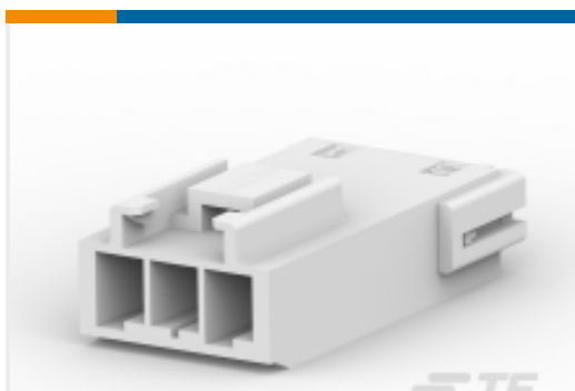
TE Part #5-179464-1 POWER DBL LOCK CAP HSG F/H 3P (GWT)