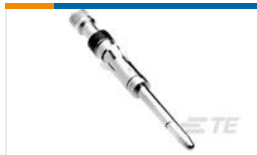
TE Part #207893-1 CONTACT PIN ASSY.