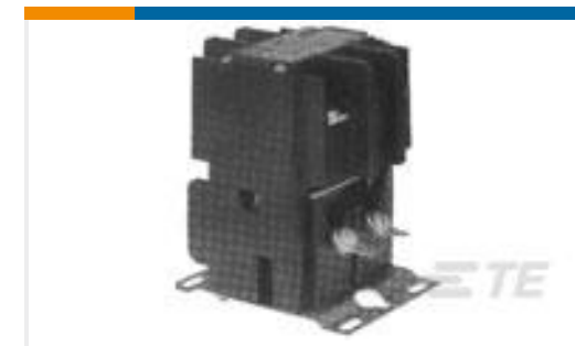
TE Part #7-1393132-2 P40P42A12P1-240=CONTACTORS