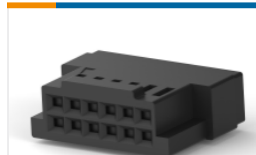
TE Part #487378-3 2.54mm FFC Connectors Receptacle Housing