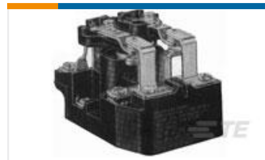
TE Part #1-1393127-2 PRD-11AG0-240=PRD