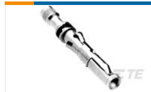
TE Part #207896-1 CONTACT SOC. ASSY.