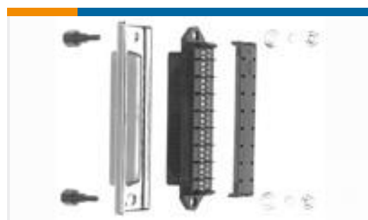
TE Part #5553636-2 KIT, HDW, EMI, 050/085, STD/METRIC