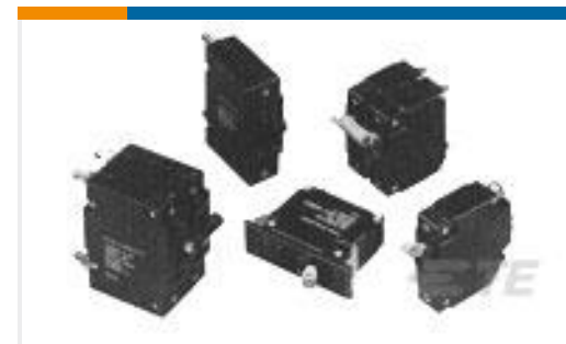
TE Part #1393255-1 W93-X112-10=M6/M7/M9/W6/W7