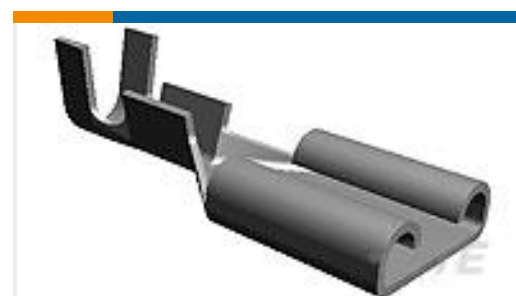
TE Part #63477-2 187 FASTON REC 20-16 AWG TPBR