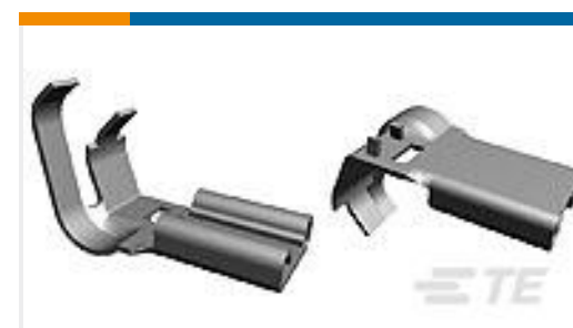
TE Part #42232-3 250 FASTON FLAG REC 18-12 AWG TPBR