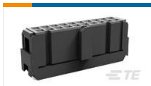
TE Part #1658621-4 20 NOVO MIL/CTR 15DP,LEAD FREE