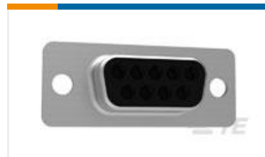
TE Part #5-747905-2 9 Rcpt Solder Cup, Gold Flash,