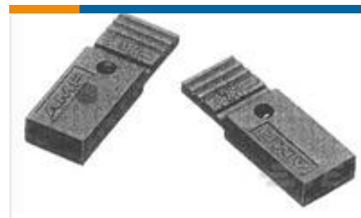
TE Part #881545-1 SHUNT LP W/HANDLE 2POS 15AU