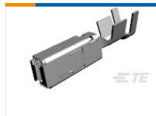
TE Part #1241390-1 AMP MCP 2.8K, CONTACT