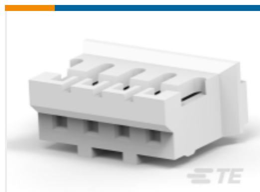
TE Part #440129-8 AMP HPI 2.0MM RECEPTACLE HOUSINGS