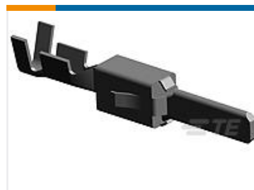
TE Part #2-964296-2 TAB A 2.8x0.8 CONTACT CF SRC Ag