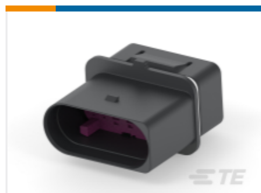
TE Part #2299450-1 14P TAB HOUSING ASSY