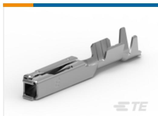
TE Part #1719958-1 GET 0.64 TERMINAL WIRE SIZE 0.