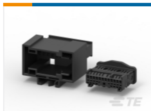
TE Part #2-1718333-1 MOS, CONNECTOR HOUSING