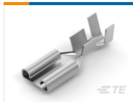
TE Part # 160920-4 FF 312 REC 2.5-4MM2 TPPB