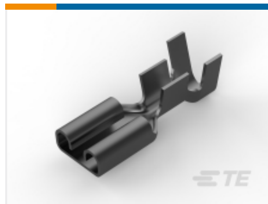
TE Part # 42904-2 FF 250 REC TERMINAL 16-12 AWG TPBR