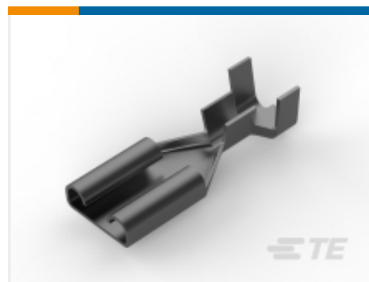
TE Part # 63813-1 FF 312 REC 16-12AWG TPBR