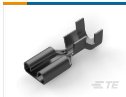
TE Part # 60249-2 FF 250 REC 16-12AWG TPBR