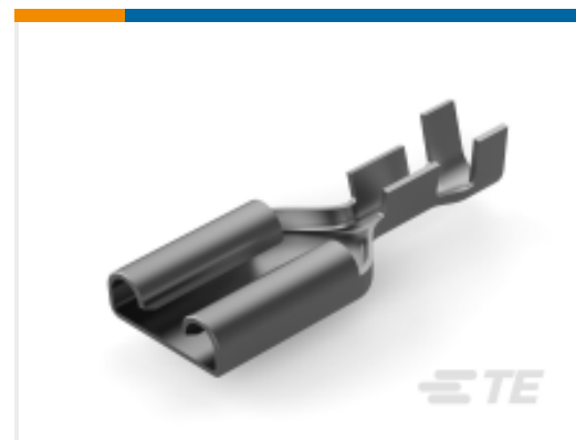
TE Part # 160557-4 FF 312 REC 0.5-1.5MM2 TPPB