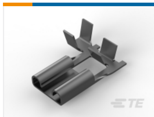
TE Part # 170191-3 FF 312 REC 18-14AWG TPBR REREELING