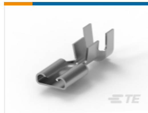
TE Part # 62891-1 FF 250 REC 16-12AWG TPBR