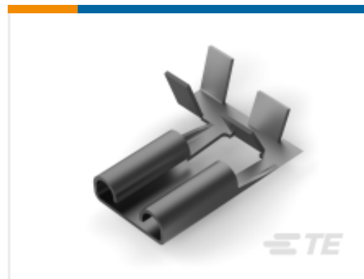
TE Part # 180373-2 FF 312 REC 1-2.5MM2 TPBR