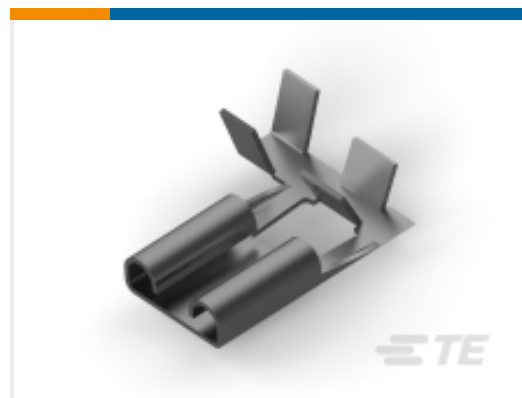
TE Part # 1-180453-2 FF 312 REC 1-2.5MM2