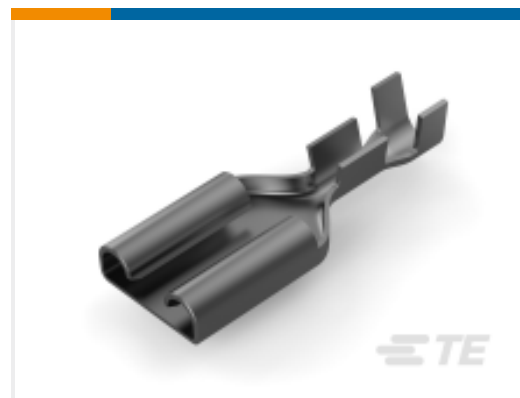
TE Part # 160557-2 FF 312 REC TERMINAL 20-15 AWG TPBR