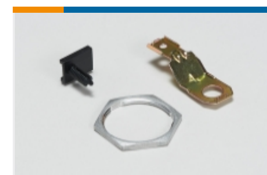
Other Automotive Connector Accessories(4)