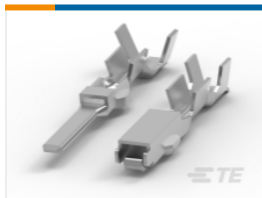
TE Part # CAT-EC7491-T273 Econoseal Receptacles and Tabs