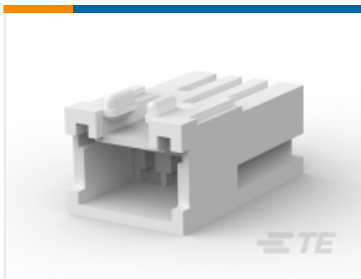
TE Part #316091-1 STD Temp Signal Double Lock Cap