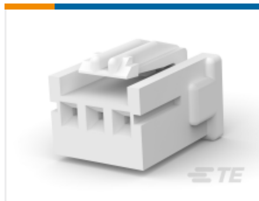
TE Part #917697-1 STD Temp Signal Double Lock Plug