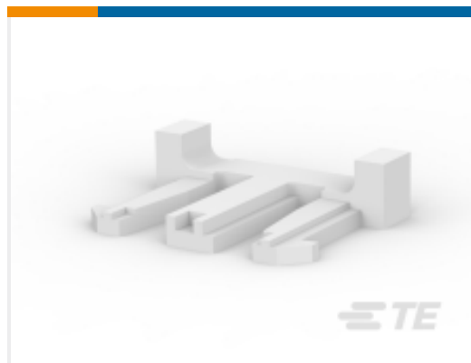
TE Part #917702-1 Signal Double Lock TPA