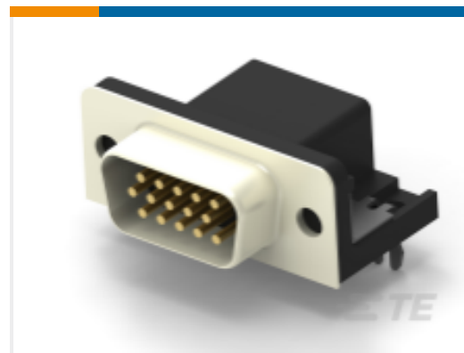
TE Part #2311774-1 AMPL PLUG, HD22, R/A, 15P, THREADED