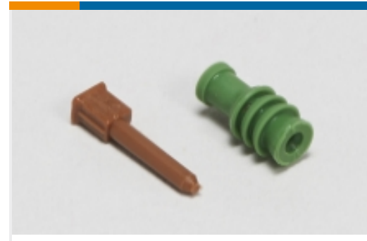
Automotive Seals & Cavity Plugs(8)