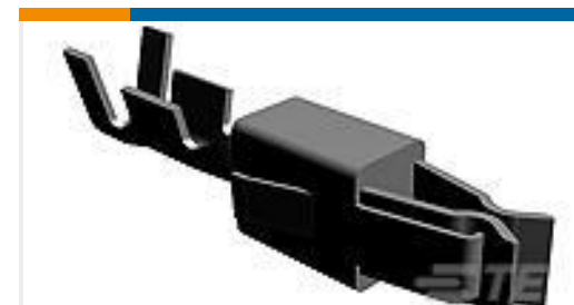
TE Part #964284-2 JPT A REC 2.8 Contact SRC Sn