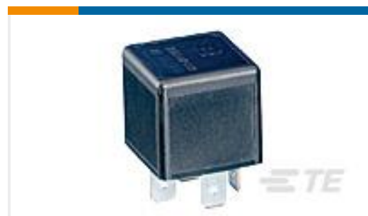
TE Part #7-1393302-5 V23134B0052C642-EV-CBOX