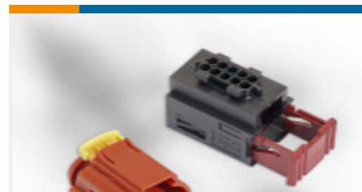
TE Part #1-967242-1 TIMER, CONNECTOR HOUSING