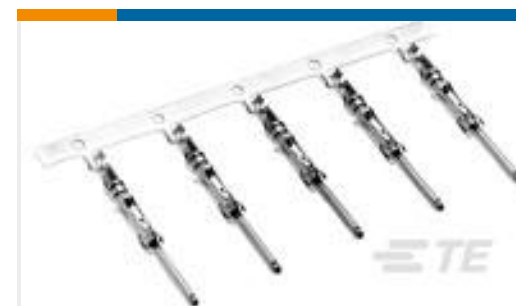
TE Part #1-66098-9 II+ PIN, 18-16, TIN STRIP