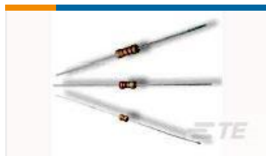
TE Part #1-1623929-5 CFR200 5% 1K0