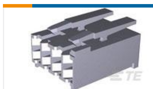
TE Part #1241965-4 STANDARD TIMER HSG. WITH EXT. LOCK.