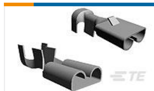
TE Part #42282-1 FF 250 REC 18-14AWG BR LP