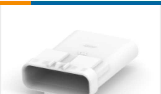
TE Part #2321924-6 RECEPTACLE HOUSING FREE HANGING 6PIN