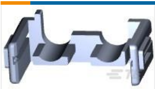
TE Part #316061-1 POWER DBL LOCK PLATE 2P /6.5MM