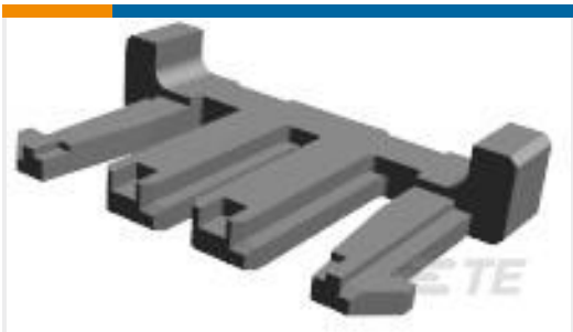
TE Part #917700-1 2.5 SIGNAL D/LOCK D.L.P 4P