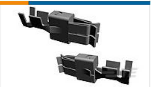
TE Part #964203-1 STD PW TIMER CONTACT