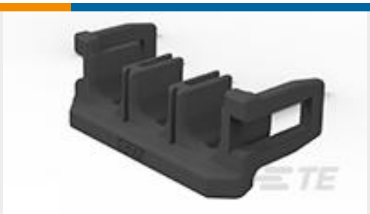
TE Part #1971777-3 PTL TPA HIGH TEMP 1 x 3 BLACK