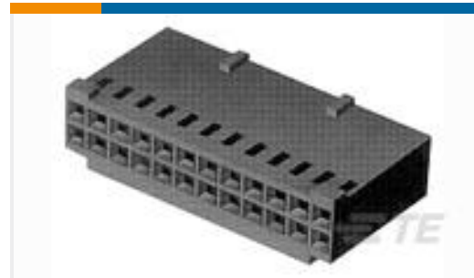
TE Part #1-87977-0 24 MODIV HSG DR MRKD .100 POL