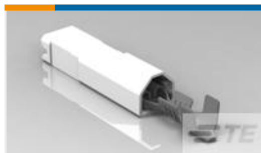
TE Part #521436-2 ULTRA-POD 110 ASSY REC 22-18 AWG TPBR