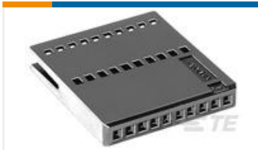
TE Part #487544-2 005 HOUSING FFC RCPT 050CL SR