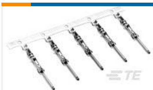
TE Part #66102-1 III+ PIN,24-20,30AU>10,STRIP