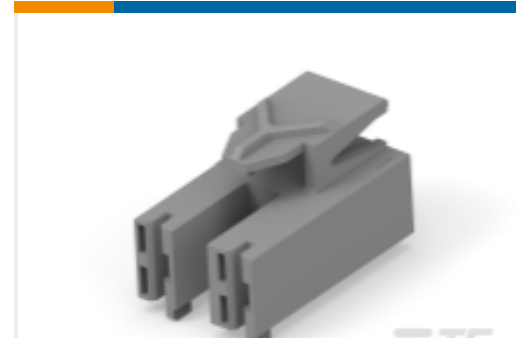
TE Part #5-1969536-6 HSG,RECP,POSILOK MKIII ,250SER,3P, 2CIR