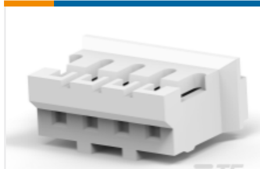
TE Part #440129-2 AMP HPI 2.0MM RECEPTACLE HOUSINGS