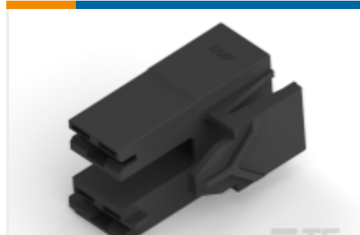
TE Part #5-1969536-4 HSG,RECP,POSILOK MKIII ,250SER,3P, 2CIR