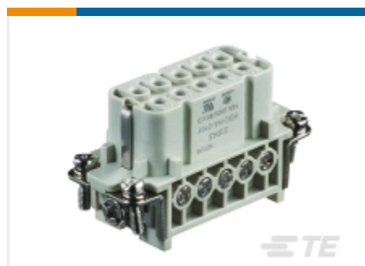
TE Part #T2010102201-002 HA-010-F