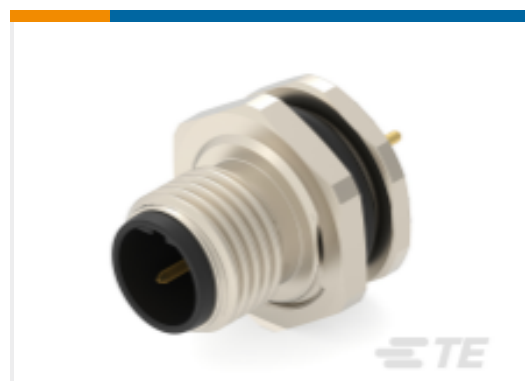
TE Part #T4140412021-000 M12,REAR MOUNTING,MALE,B CODE,2P