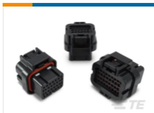
TE Part #3-1437290-8 SUPERSEAL Connector Housings: 1.0 mm