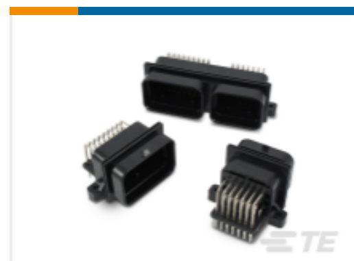
TE Part #6437288-6 SUPERSEAL Connector Headers: 1.0 mm