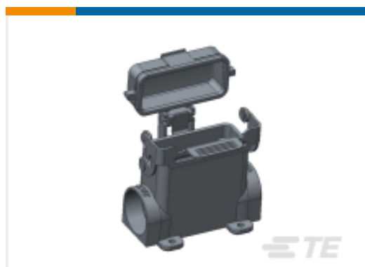
TE Part #T1629101225-000 H10A-SDRMS-2M25