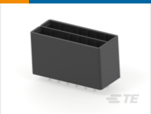
TE Part #2-178136-2 Header Assembly: Wire-to-Board, 15A, gold or tin plated