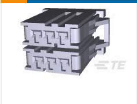
TE Part #3-178127-6 DYNAMIC D3100 REC HSG 6P (DBL)