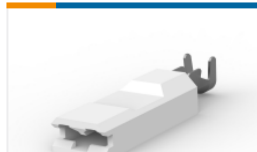
TE Part #521284-2 ULTRA POD: Straight, Receptacle Assembly, Tin Plated, .187 inch