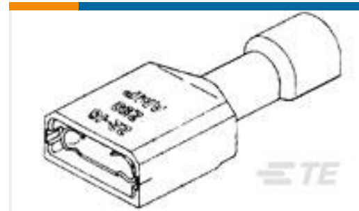
TE Part #2-520310-2 ULTRA-FAST .110/.125 ASY REC 22-18 TPBR