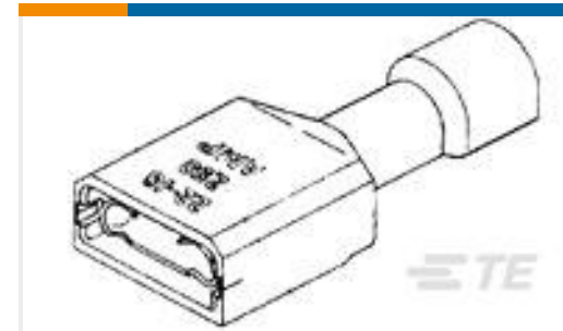
TE Part #2-520193-2 ULTRA-FAST 187 ASY REC 22-18 TPBR