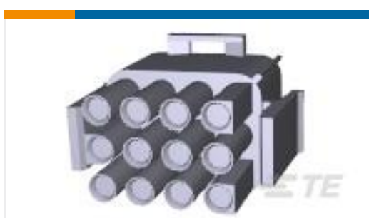
TE Part #794742-1 12P UMNL PLUG HSG NATL