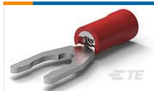
TE Part #53242-6 PG SPR SPD 22-16COM22-18MIL 10