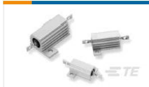
TE Part #4-1879073-9 THS10 6K8 5%