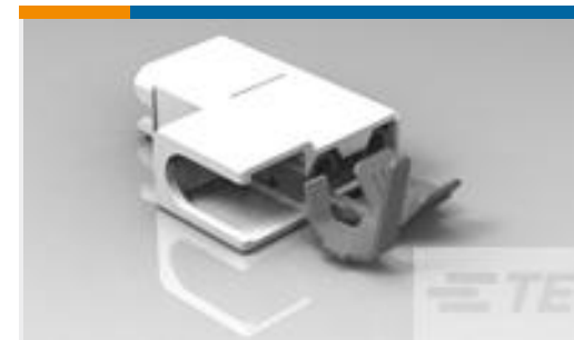
TE Part #521633-2 ULTRA-POD 250 ASY REC 18-14 AWG TPBR