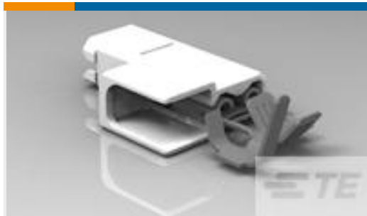
TE Part #521597-2 ULTRA-POD 187 ASY REC 18-14 TPBR