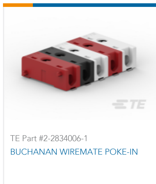
TE Part #2-2834006-1 BUCHANAN WIREMATE POKE-IN