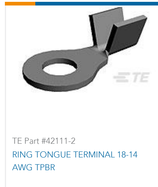
TE Part #42111-2 RING TONGUE TERMINAL 18-14 AWG TPBR