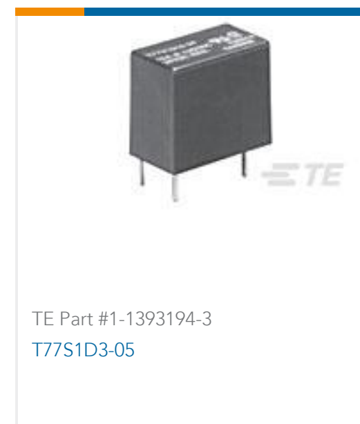
TE Part #1-1393194-3 T7S1D3-05