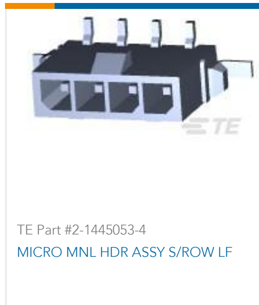
TE Part #2-1445053-4 MICRO MNL HDR ASSY S/ROW LF