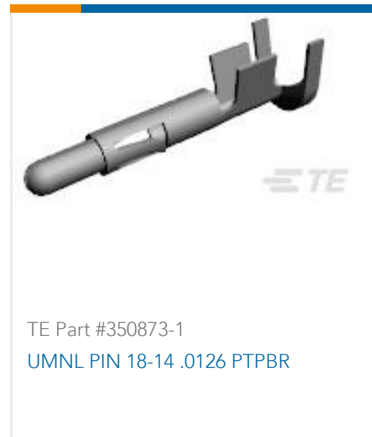
TE Part #350873-1 UMNL PIN 18-14 .0126 PTPBR