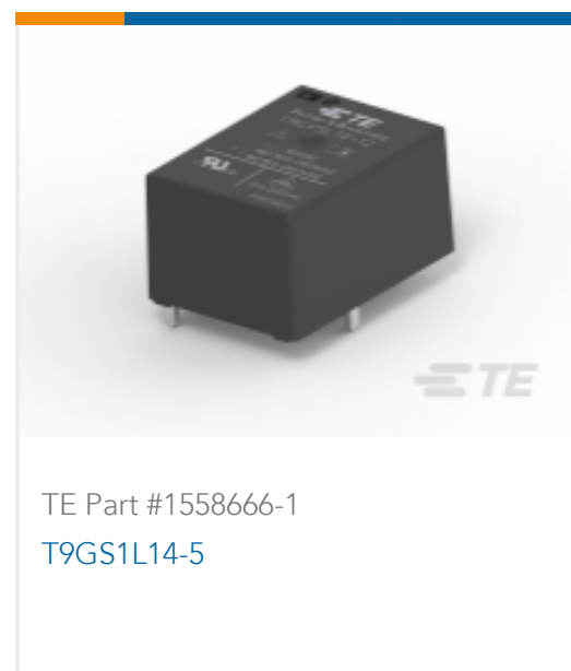
TE Part #1558666-1 T9GS1L14-5