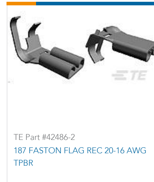
TE Part #42486-2 187 FASTON FLAG REC 20-16 AWG TPBR