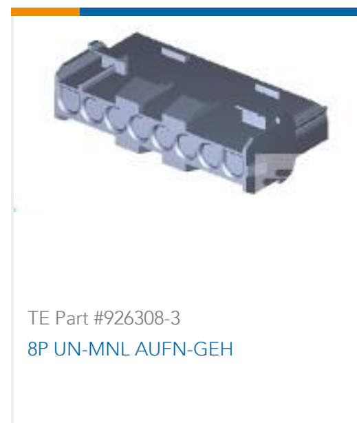
TE Part #926308-3 8P UN-MNL AUFN-GEH