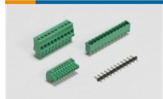
PCB Terminal Blocks(25)