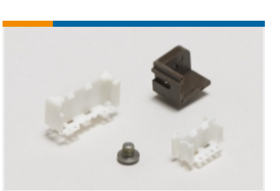
PCB Connector Mounting(8)