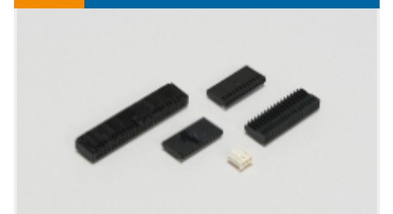
Wire-to-Board Connector Assemblies & Housings(152)