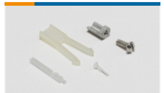
PCB Connector Keying(1)