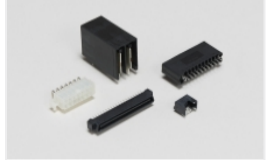
Standard Rectangular Connectors(2)