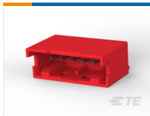
TE Part #1-1871843-6 GIC2.5 HDR ASSY TIN VERSION 6P RED