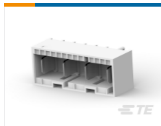
TE Part #2-2232511-7 7P, RAST 5 TAB HEADER, THV