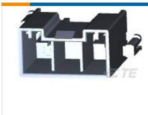
TE Part #1747996-1 GHC EYELET 12.4 2POS HEADER ASSY NATURAL