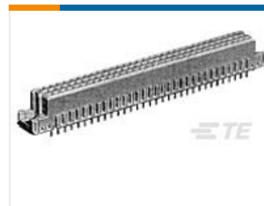
TE Part #650963-5 096 EURO TYPE C RECEPT BL ASSY