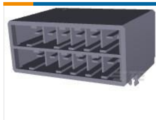
TE Part #1-316081-2 DYNAMIC D-3200 HDR ASSY 12P H