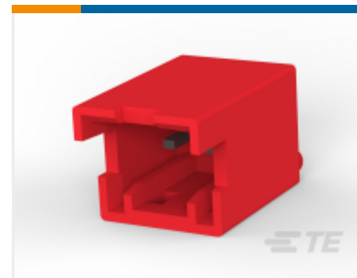
TE Part #1-1871843-2 GIC2.5 HDR ASSY TIN VERSION 2P RED