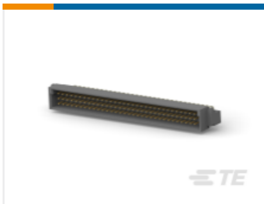
TE Part #650947-5 096 EURO TYPE C PIN ST ASSY