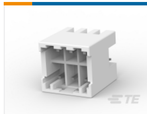
TE Part #2-1747052-3 Glow Wire GRACE INERTIA Header