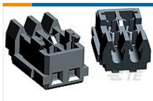
TE Part #1-353293-5 1.5 MINI-CT RECEPTACLE