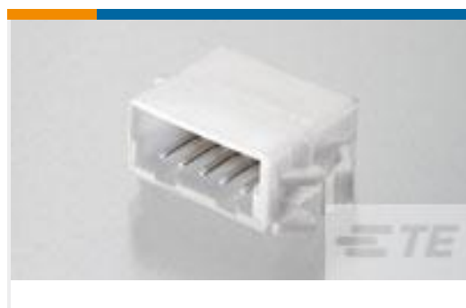
TE Part #292254-5 CT RELAY HDR ASSY 5P NAT