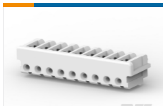
TE Part #173977-9 AMP COMMON TERMINATION HOUSINGS