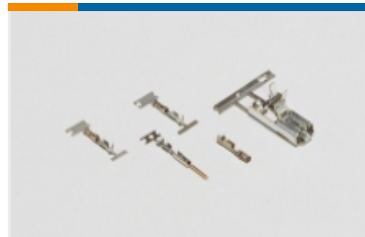
Wire-to-Board Connector Contacts(5) & Housings(71)