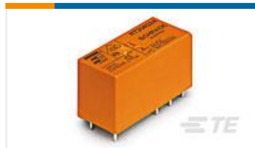
TE Part #4-1393243-3 RT423730