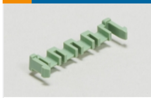
PCB Latches, Locks & Retainers(5)