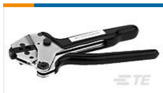
TE Part #1-1105851-8 RSZ.HE-HND-HVT