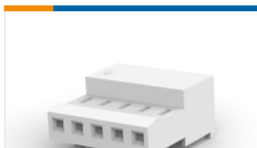
TE Part #3-641535-5 05P MTA100 CONN ASSY 24AWG