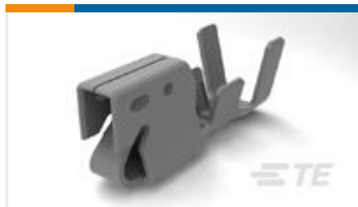
TE Part #1744144-1 EP-II CONTACT LANCELESS, 22-18