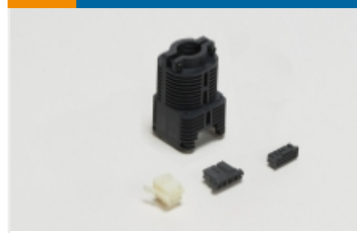
Rectangular Connector Housings(49)