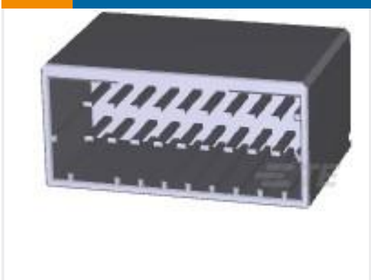
TE Part #1318127-1 DYNAMIC D2100 HDR V ASSY 20P