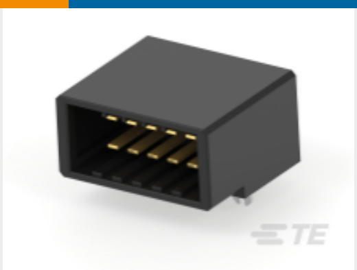
TE Part #1-178315-2 Header Assembly: Wire-to-Board, 15A, gold or tin plated