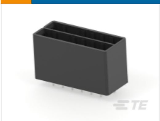
TE Part #2-917337-2 Header Assembly: Wire-to-Board, 15A, gold or tin plated