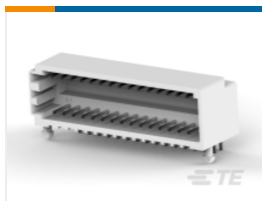
TE Part # 3-292138-0 CT DOUBLE ROW ASSY H 30P HDR N