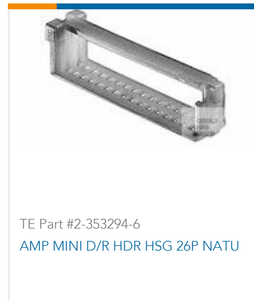
TE Part #2-353294-6 AMP MINI D/R HDR HSG 26P NATU