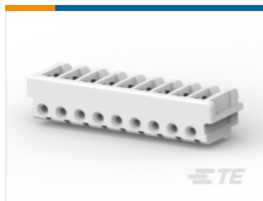
TE Part #1-173977-4 AMP COMMON TERMINATION HOUSINGS