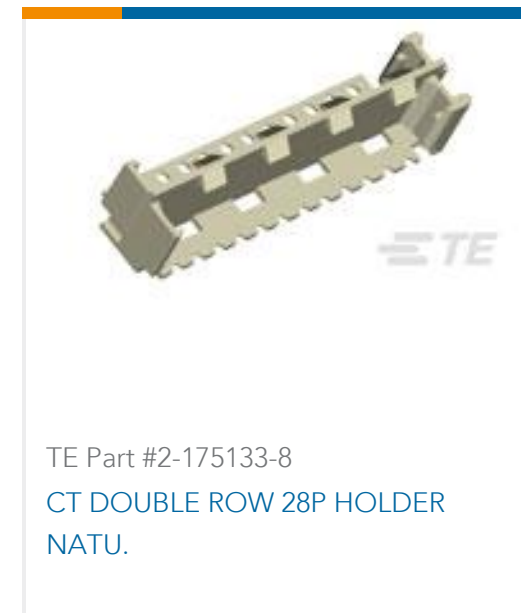
TE Part #2-175133-8 CT DOUBLE ROW 28P HOLDER NATU.