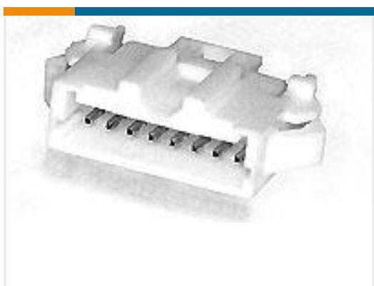
TE Part #1-292215-1 MINI CT SGL RELAY 11P NAT