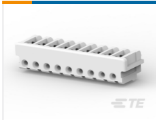
TE Part # CAT-AM7017-H8172 AMP COMMON TERMINATION HOUSINGS