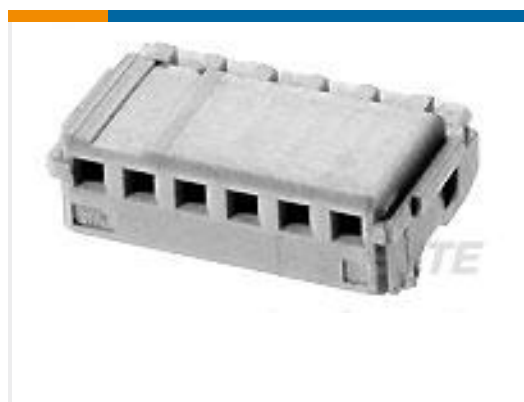
TE Part #1-353908-7 CT REC HSG 17P CRIMP TYPE WHIT