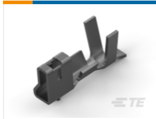
TE Part # CAT-AM7017-C7671 AMP COMMON TERMINATION CONTACTS