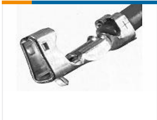
TE Part # 353918-1 CT 1.5MM REC CONT CRIMP TYPE