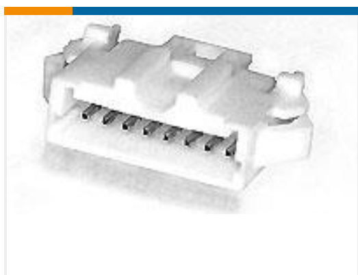
TE Part #1-292215-8 MINI CT SGL RELAY 18P NAT