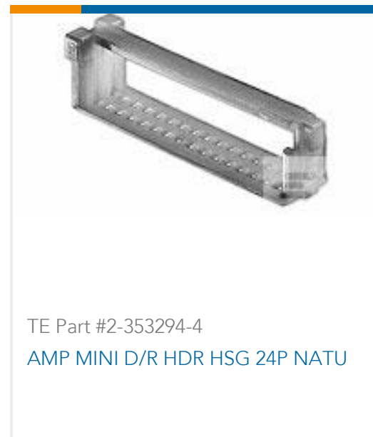
TE Part #2-353294-4 AMP MINI D/R HDR HSG 24P NATU