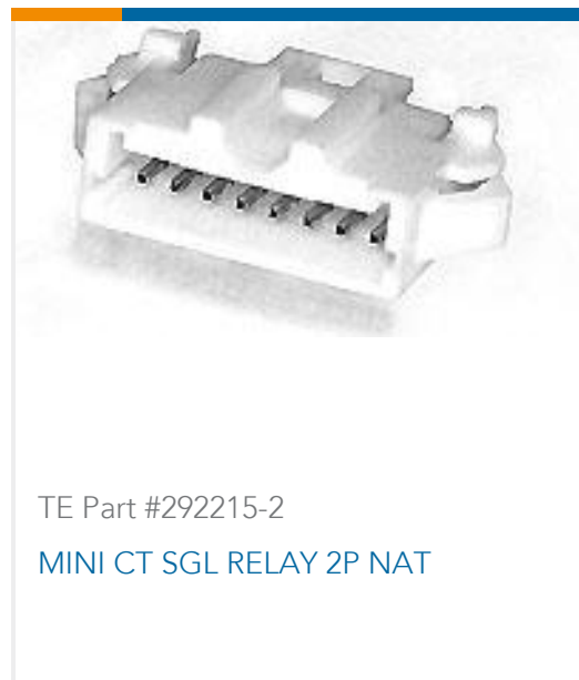
TE Part #292215-2 MINI CT SGL RELAY 2P NAT