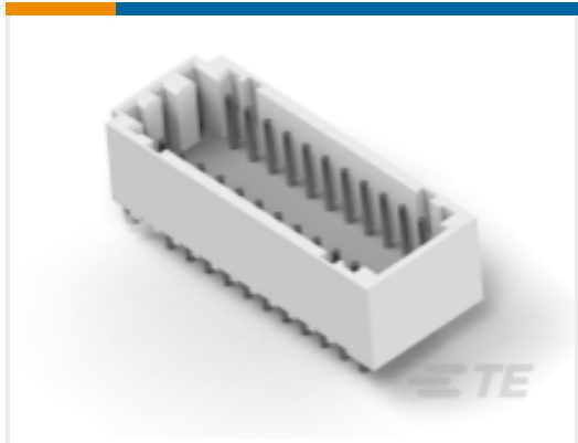
TE Part # CAT-3980700-DRWBSV CT 2mm Dbl Row Assembly w/Boss: Vert.