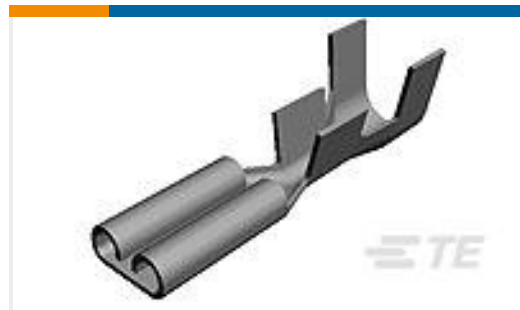
TE Part #42566-1 187 FASTON REC 20-16 AWG BR