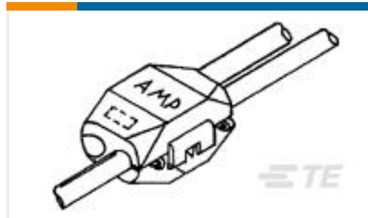
TE Part #53440-2 ELECTRO-TAP, 20-18 AWG RUN&TAP