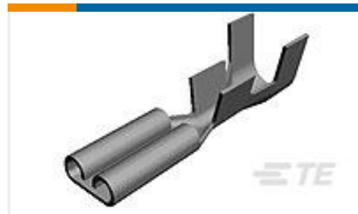
TE Part #42741-1 250 FASTON FLAG REC 18-14 AWG BR