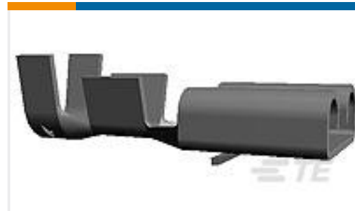
TE Part #42281-2 FF 250 REC 18-14AWG TPBR