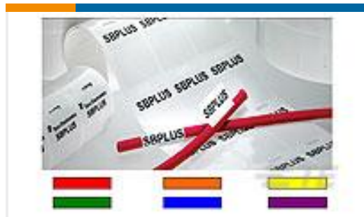
TE Part #CR6865-000 SBP050100WE5-T200