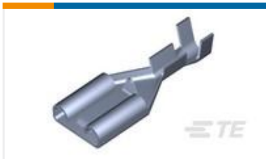
TE Part #1217378-1 RCPT 250 POS-LOCK 22-18 0126BR