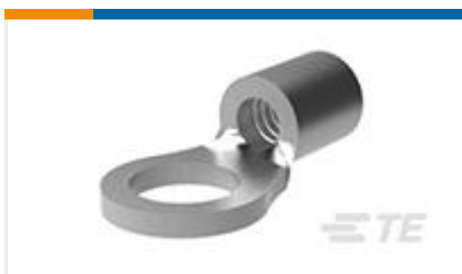
TE Part #8-34114-1 SOLIS R 22-16COMM22-18MIL 5/16