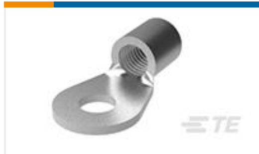
TE Part #2-321298-6 TERM,SOLIS RING #6 10