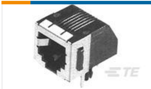
TE Part #5406435-1 MJ,LPF,R/A,6P,SHLD,PCB GRD