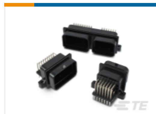
TE Part #6437288-6 SUPERSEAL Connector Headers: 1.0 mm