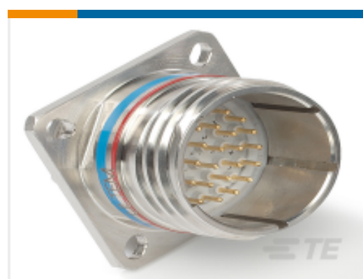
TE Part #YDTS20T25-19PNV001 RECP ASSY