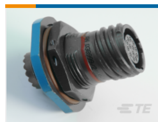
TE Part #YDTS24T25-29SAV001 Jam Nut: D38999, 25-29 Insert