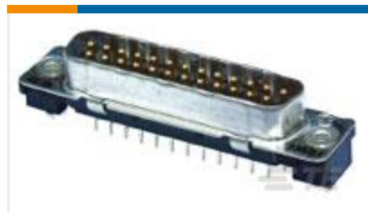
TE Part #5745968-7 25 PLUG SP/FMS INSRT