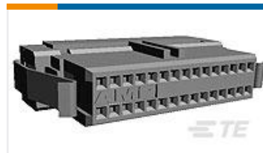
TE Part #2-111196-9 026 RCPT SYSTEM 50 30 DPLX