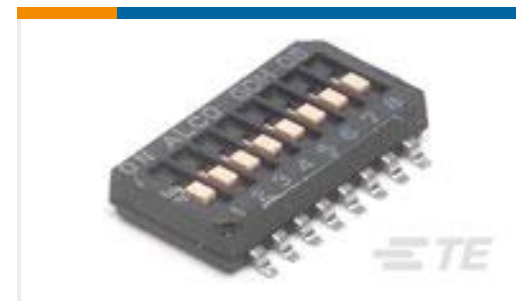
TE Part #1571983-9 GDH06STR04=DIP SWITCH