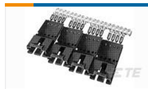
TE Part #5-103945-7 2X8 MTE SHRD PIN SR LATCH .100