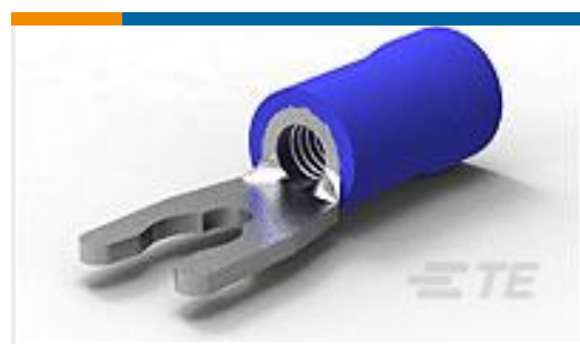
TE Part #52955-1 TERMINAL,PG SPR SPD 16-14 6