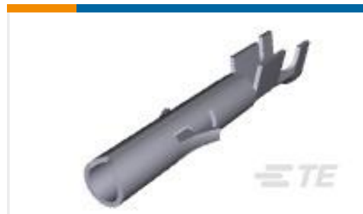
TE Part #350851-2 UMNL SOK 24-18 AUNIBR