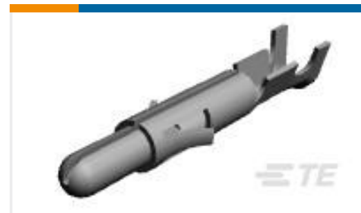
TE Part #350561-2 UMNL PIN 24-18 .0126 AU/BR