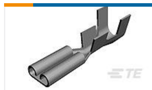
TE Part #60415-1 110 FASTON REC 22-18 AWG TPBR