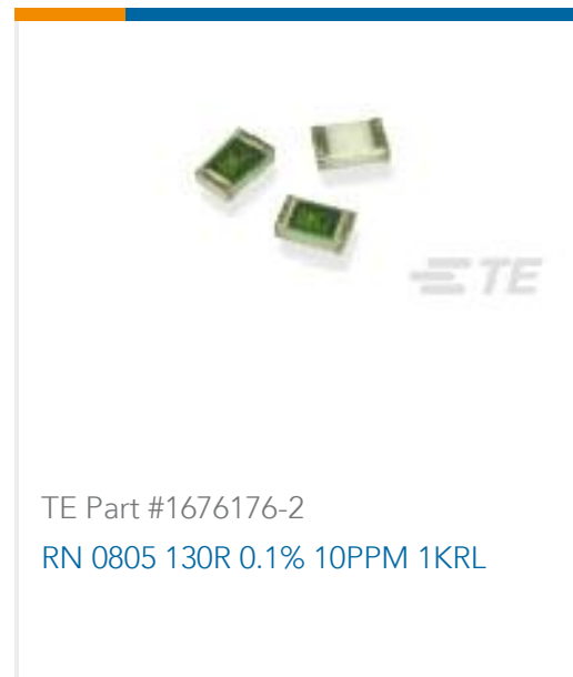
TE Part #1676176-2 RN 0805 130R 0.1% 10PPM 1KRL