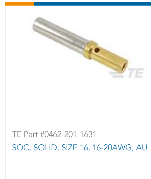
TE Part #0462-201-1631 SOC, SOLID, SIZE 16, 16-20AWG, AU