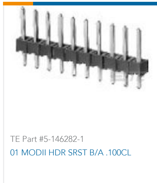
TE Part #5-146282-1 01 MODII HDR SRST B/A .100CL