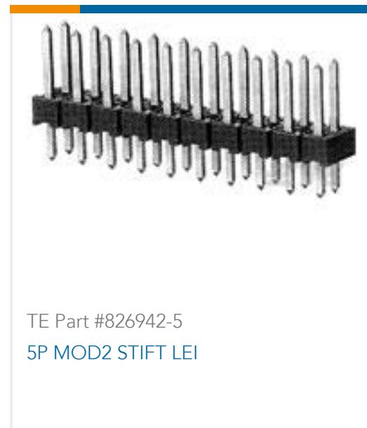
TE Part #826942-5 5P MOD2 STIFT LEI