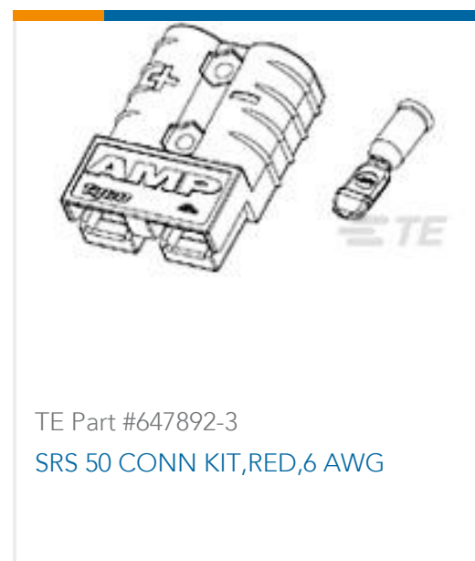
TE Part #647892-3 SRS 50 CONN KIT, RED, 6 AWG