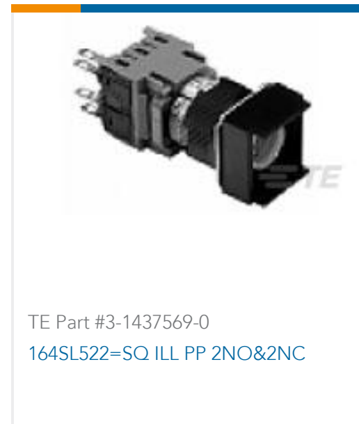
TE Part #3-1437569-0 164SL522=SQ ILL PP 2NO&2NC