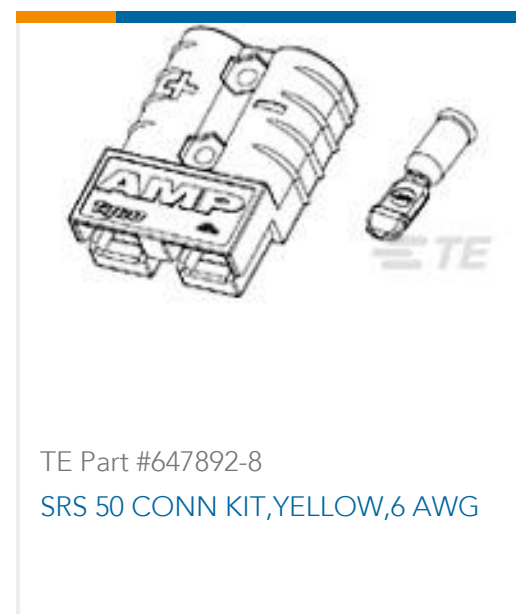
TE Part #647892-8 SRS 50 CONN KIT, YELLOW, 6 AWG