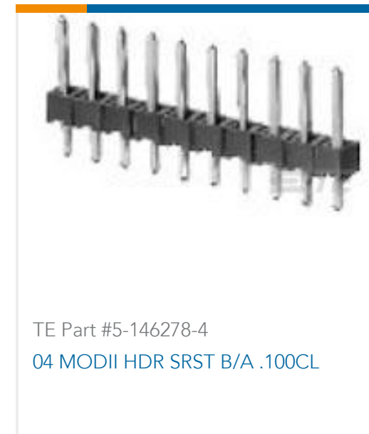
TE Part #5-146278-4 04 MODII HDR SRST B/A .100CL