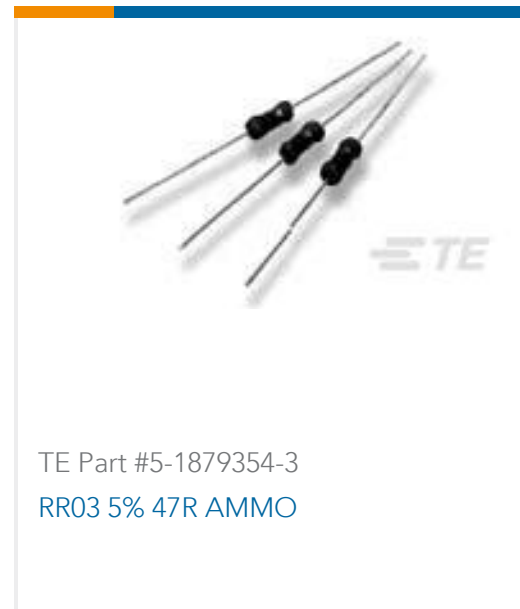
TE Part #5-1879354-3 RR03 5% 47R AMMO