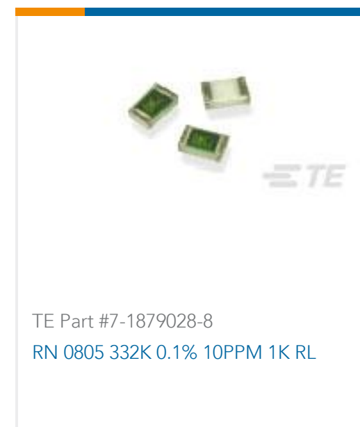
TE Part #7-1879028-8 RN 0805 332K 0.1% 10PPM 1K RL