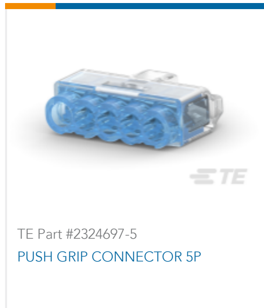
TE Part #2324697-5 PUSH GRIP CONNECTOR 5P