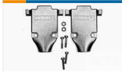
TE Part #5745173-3 CABLE CLAMP KIT,SZ 3