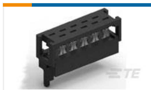
TE Part #1-2178712-0 10P, MOW, MICRO-MATCH VALUE LINE