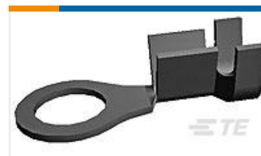
TE Part #160344-2 RING TONGUE 20-16 AWG .025 X .840