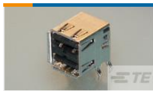
TE Part #5787617-4 RECP ASSY, R/A, STACKED, THRU- HOLE, USB,