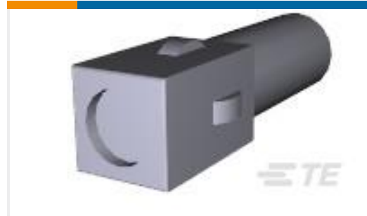
TE Part #350865-1 01P UMNL PLUG HSG