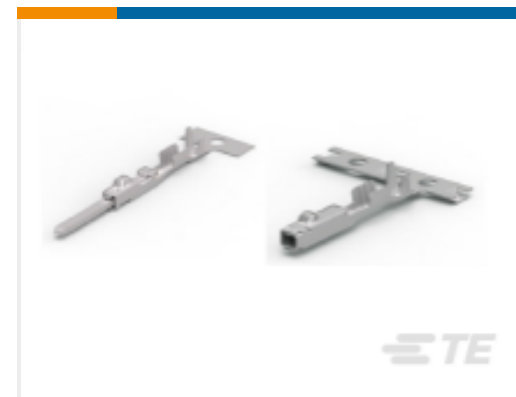
TE Part #1418850-3 MCON, RECEPTACLE AND TAB