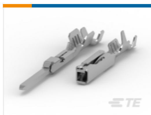
TE Part #1924879-2 GET .64 CONNECTOR SYSTEM, RECEPT AND TAB