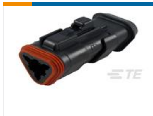
TE Part #DT06-3S-CE13 PLG, 3P, BLK, E, SEAL RET, XCAP