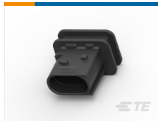
TE Part #2112299-1 PROTECTION CAP, FOR REC.HSG GR