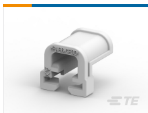
TE Part #2203698-1 2P MCON UNSEALED PLUG WIRE DRESS