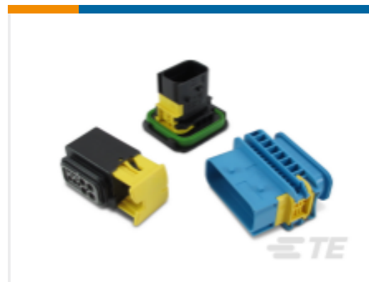
TE Part #1-1418469-1 Heavy Duty Sealed Connector Series Housings