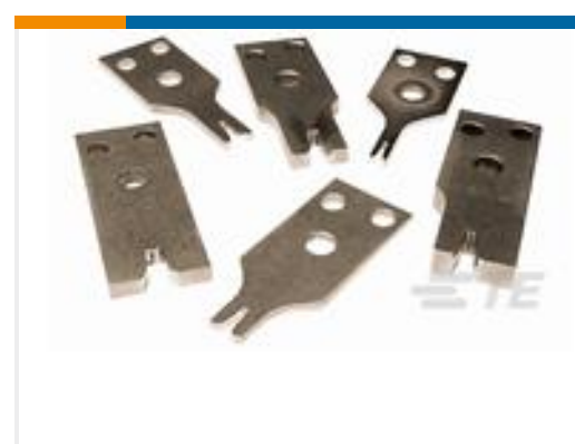
TE Part #3-456403-8 CRIMPER, WIRE .062F