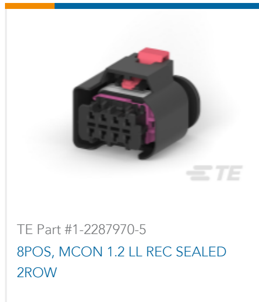
TE Part #1-2287970-5 8POS, MCON 1.2 LL REC SEALED 2ROW