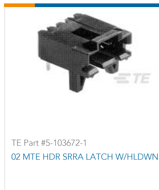
TE Part #5-103672-1 02 MTE HDR SRRA LATCH W/HLDWN