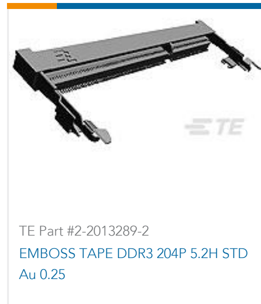
TE Part #2-2013289-2 EMBOSS TAPE DDR3 204P 5.2H STD Au 0.25