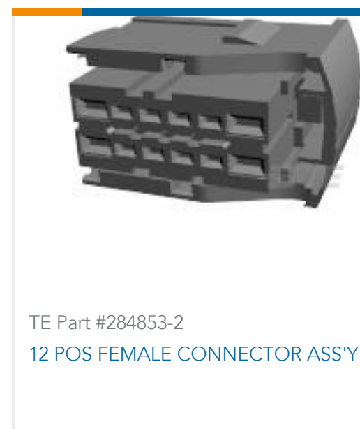
TE Part #284853-2 12 POS FEMALE CONNECTOR ASS'Y