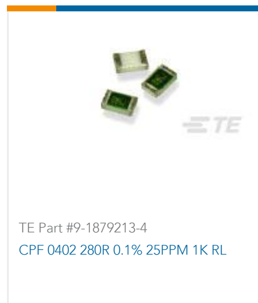
TE Part #9-1879213-4 CPF 0402 280R 0.1% 25PPM 1K RL