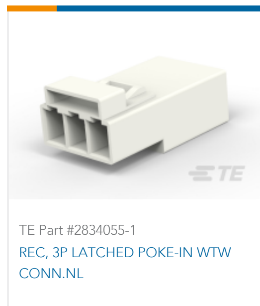
TE Part #2834055-1 REC, 3P LATCHED POKE-IN WTW CONN.NL