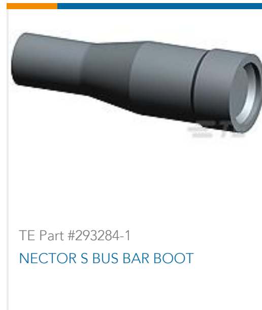
TE Part #293284-1 NECTOR S BUS BAR BOOT