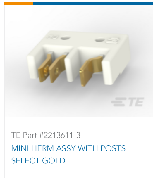
TE Part #2213611-3 MINI HERM ASSY WITH POSTS - SELECT GOLD