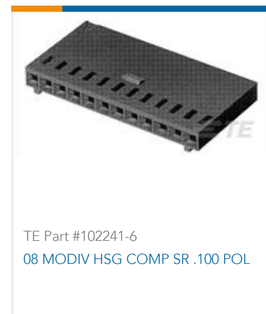
TE Part #102241-6 08 MODIV HSG COMP SR .100 POL