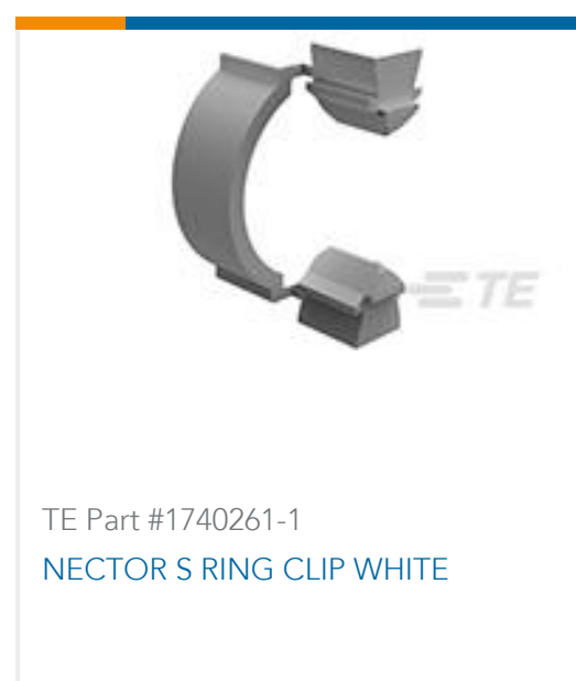
TE Part #1740261-1 NECTOR S RING CLIP WHITE