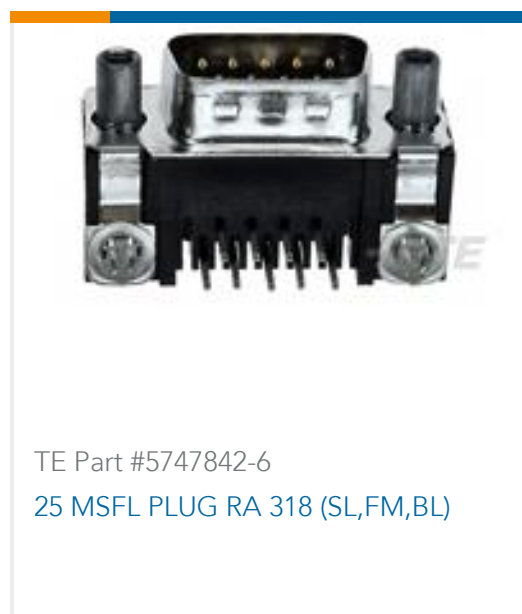
TE Part #5747842-6 25 MSFL PLUG RA 318 (SL,FM,BL)