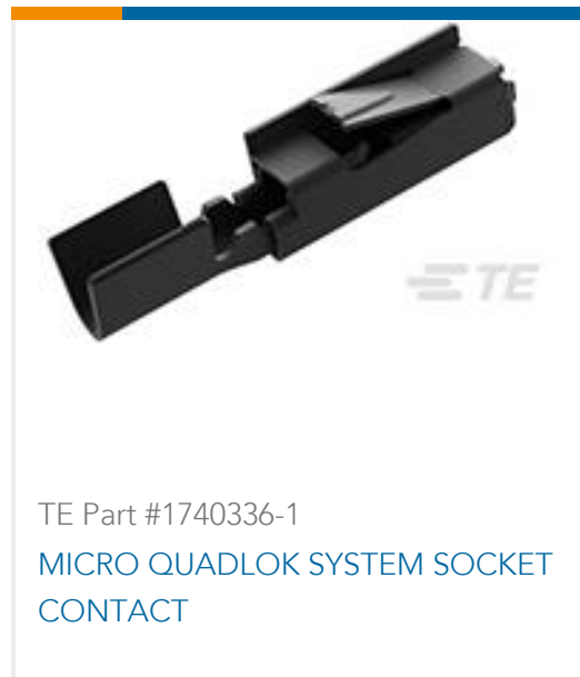
TE Part #1740336-1 MICRO QUADLOK SYSTEM SOCKET CONTACT