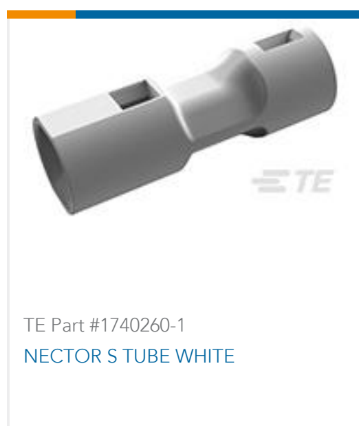
TE Part #1740260-1 NECTOR S TUBE WHITE