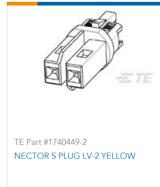
TE Part #1740449-2 NECTOR S PLUG LV-2 YELLOW