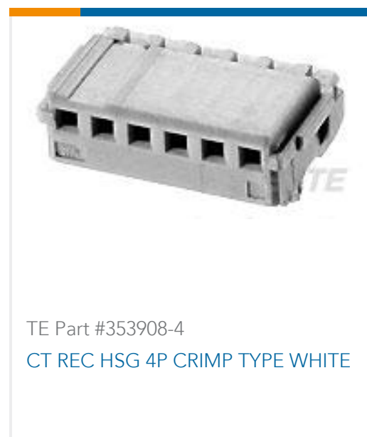
TE Part #353908-4 CT REC HSG 4P CRIMP TYPE WHITE