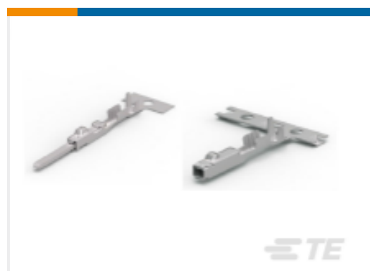
TE Part #1718758-1 MCON, RECEPTACLE AND TAB