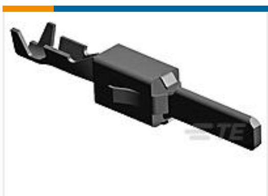
TE Part #2-964292-1 TAB A 2.8x0.8 CONTACT CF SRC Sn