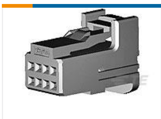
TE Part #1379662-1 12W PLUG HSG ASSY BLACK