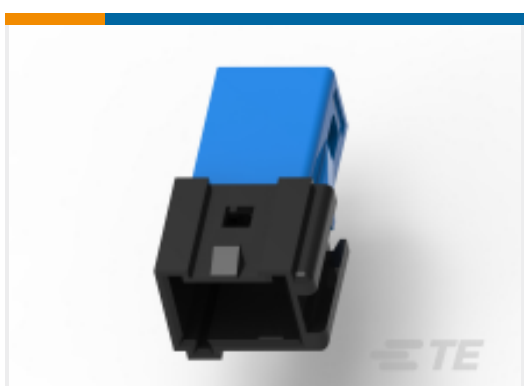
TE Part #284869-3 8POS MQS TAB