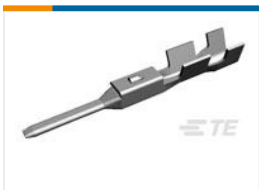
TE Part #917309-1 MINI MLC CONN. TAB CONT.