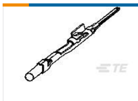
TE Part #1376109-1 025 TAB CONT