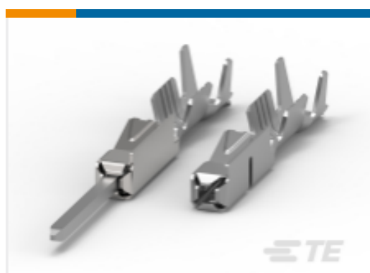
TE Part #6-928918-1 MQS, RECEPTACLE AND TAB