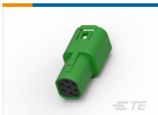
TE Part #2822344-1 MINI MLC CAP HSG ASSY 7P