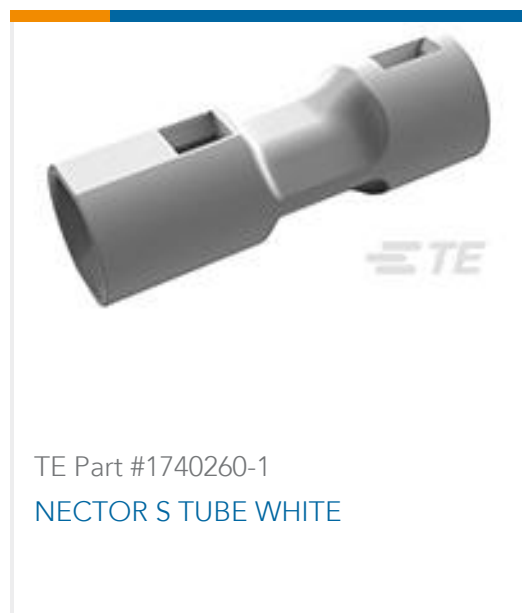
TE Part #1740260-1 NECTOR S TUBE WHITE