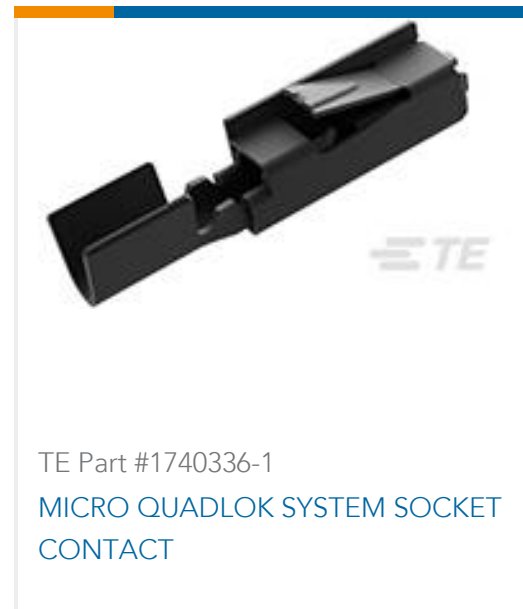
TE Part #1740336-1 MICRO QUADLOK SYSTEM SOCKET CONTACT