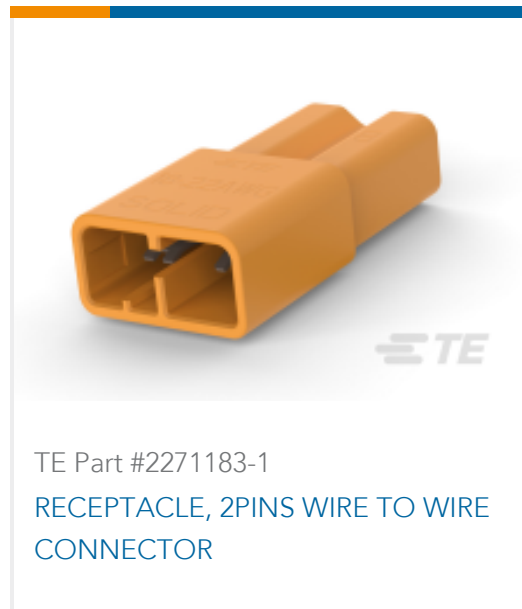
TE Part #2271183-1 RECEPTACLE, 2PINS WIRE TO WIRE CONNECTOR