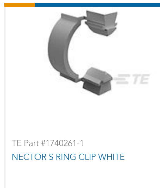
TE Part #1740261-1 NECTOR S RING CLIP WHITE