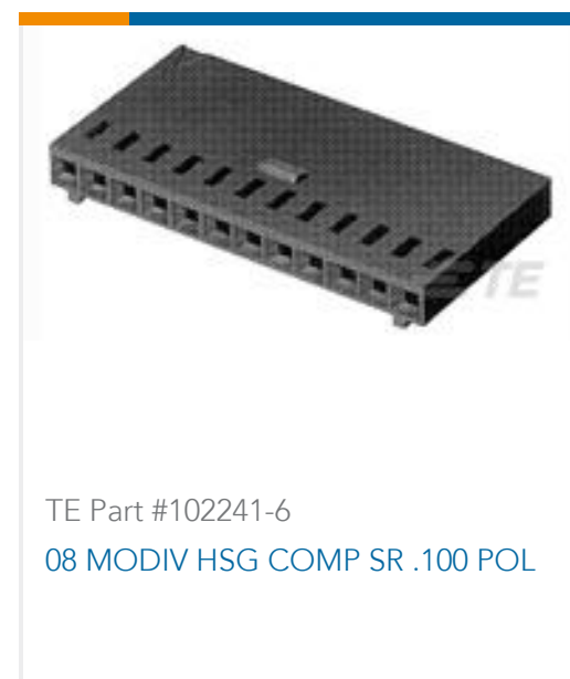
TE Part #102241-6 08 MODIV HSG COMP SR .100 POL