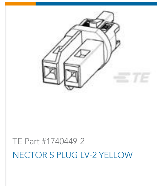
TE Part #1740449-2 NECTOR S PLUG LV-2 YELLOW